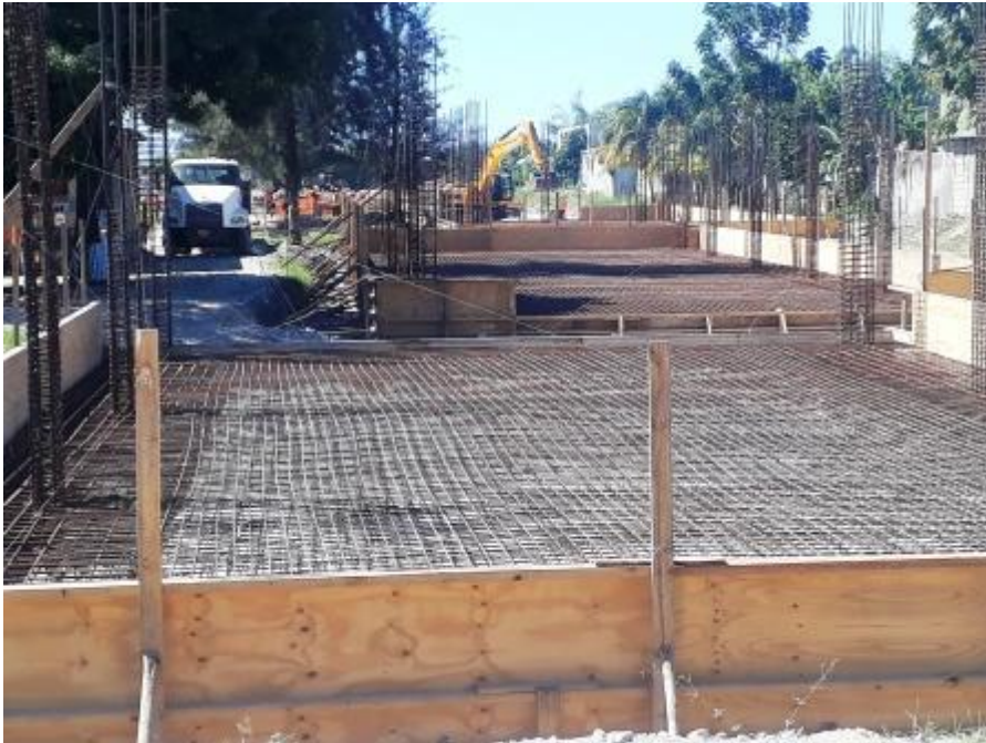
Finished reinforcement awaiting the pouring of concrete