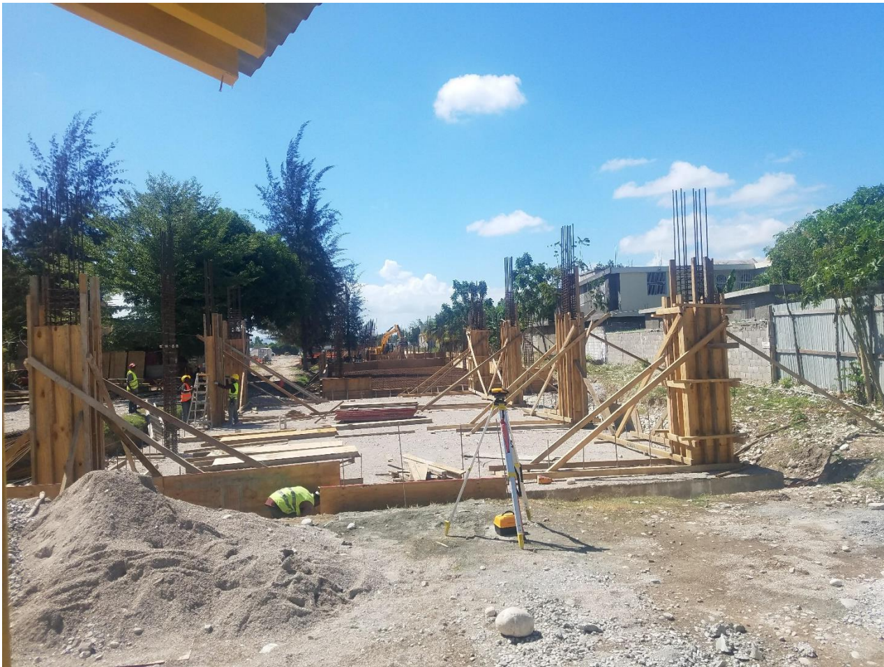
Les Cayes Works – Feb/2020