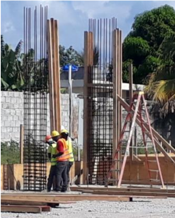
Les Cayes Works – Feb/2020