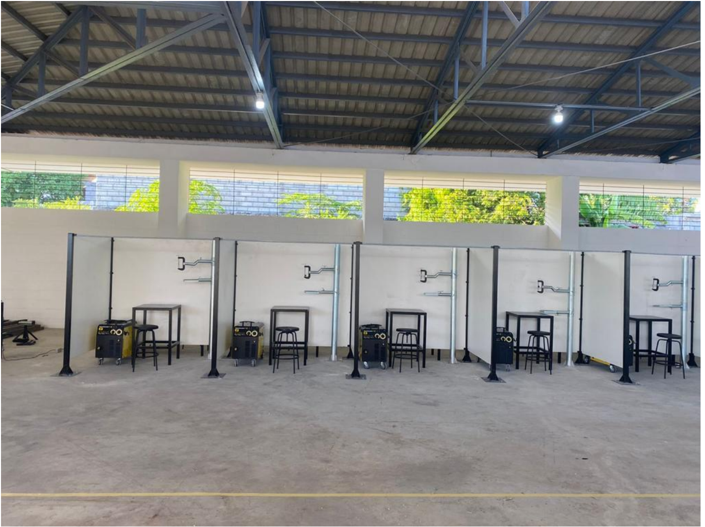
Inauguration of the Vocational Training Center of Les Cayes on November 1, 2024