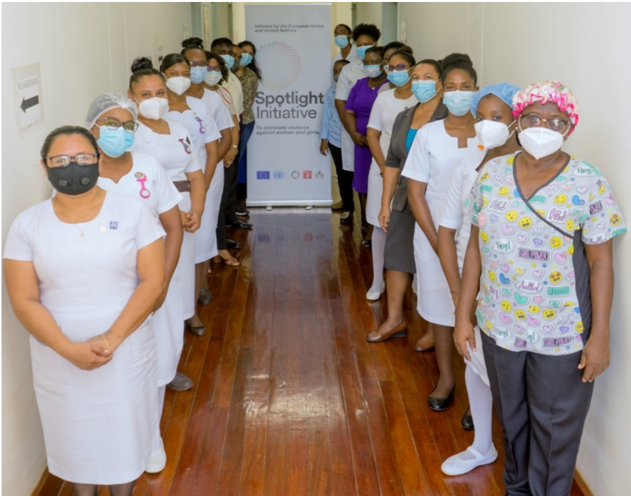
Some of the health care workers who participated in the PAHO led training in New Amsterdam, Region 6, Guyana.