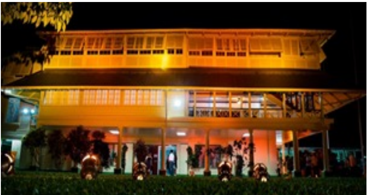
State House in orange as part of an 'orange spaces' activity held in partnership with the High Commission of Canada during the 16 Days of Activism observance.