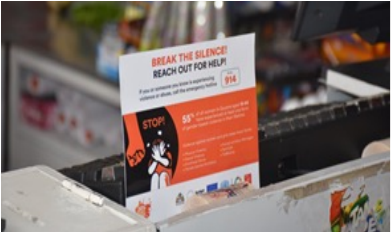
Information sticker placed at a supermarket during the 16 days of activism observance.