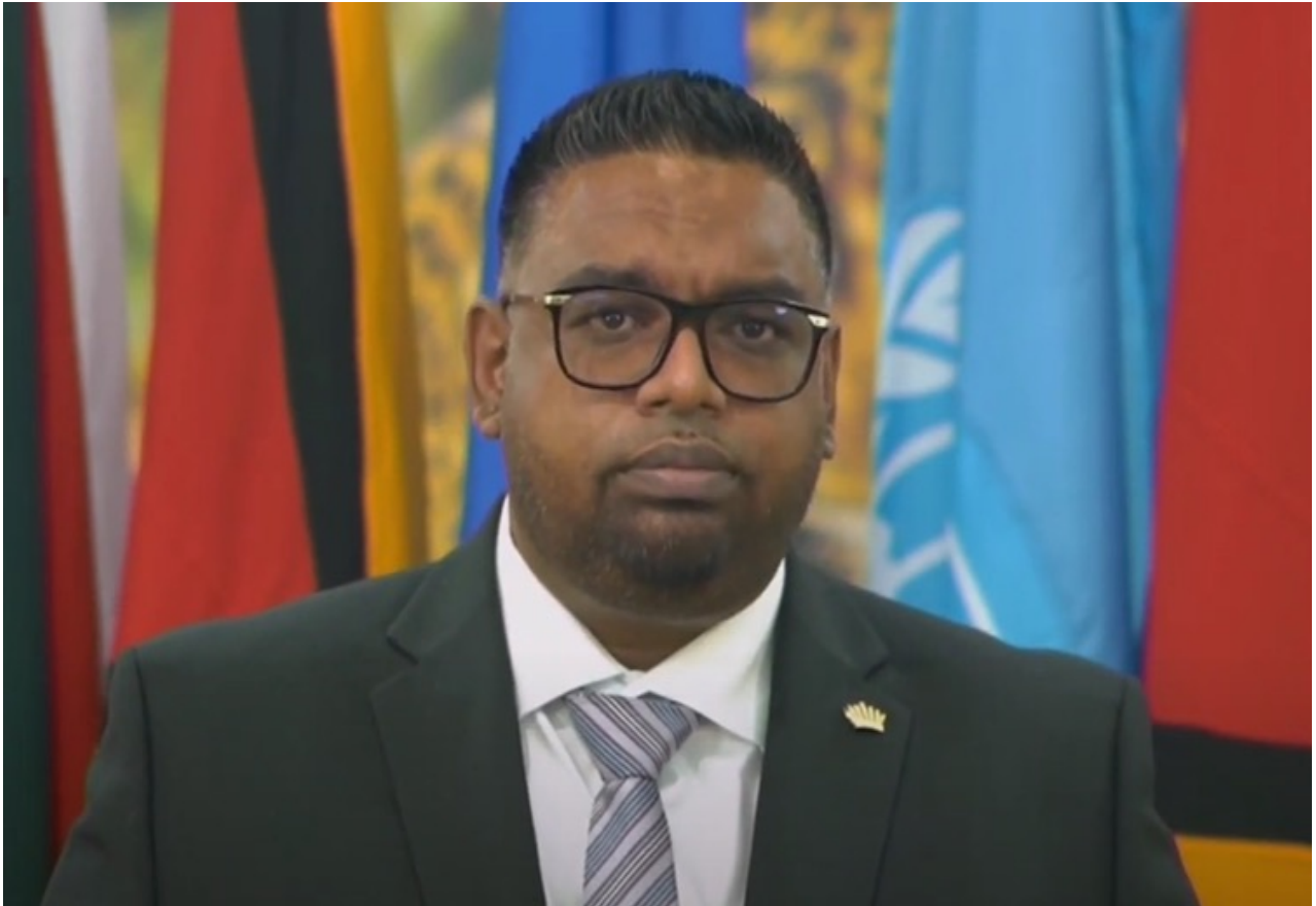
His Excellency Dr. Mohamed Irfaan Ali, delivering his speech during the Official Launching of the Programme.