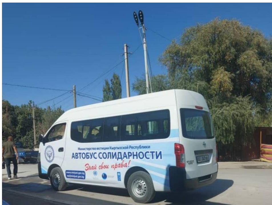
Consultations for 238 residents in Batken province on various issues including family, land, counselling and many more with the Bus of Solidarity.