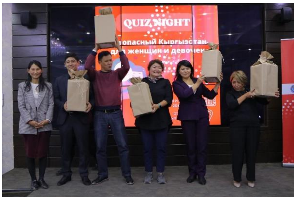
Impressions from a 'Quiz Night.' UNDP