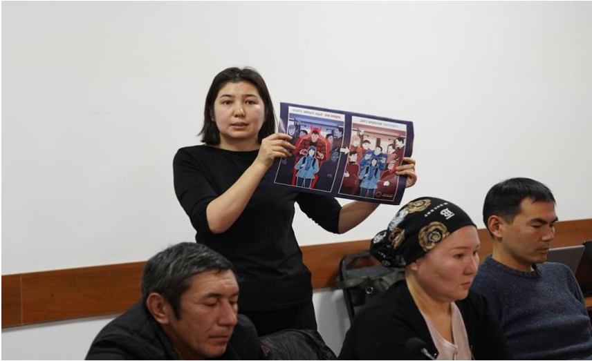
Posters are presented for the anti-harassment campaign in partnership with Bishkek Public Transport