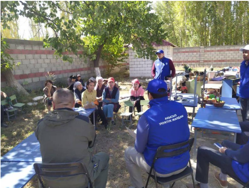
Consultations for 238 residents in Batken province on various issues including family, land, counselling and many more with the Bus of Solidarity.