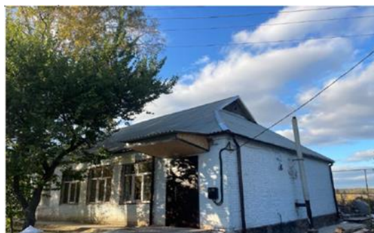
Photo 3 and 4: Damaged (left) and rehabilitated (right) grocery shop in Buimer Trostianetska hromada in Sumska oblast