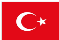
Government of Turkey