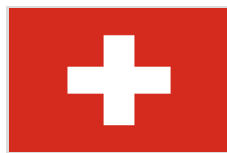
Government of Switzerland