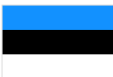
Government of Estonia