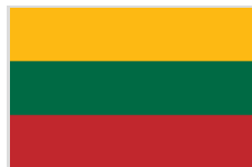
Government of Lithuania