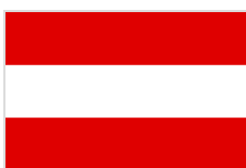
Government of Austria