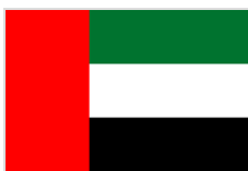
Government of United Arab Emirates