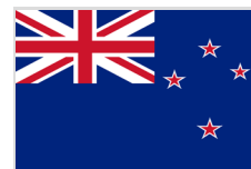
Government of New Zealand