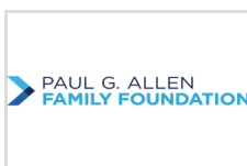
Paul G Allen Family Foundation