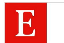
The Economist Group