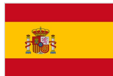
Government of Spain