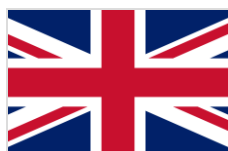
Government of the United Kingdom (Former DFID), (Foreign, Commonwealth & Development Office)