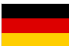
Government of Germany