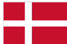
Government of Denmark