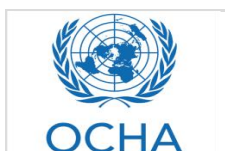
OCHA (Office for the Coordination of Humanitarian Affairs)