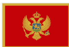
Government of Montenegro