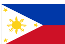
Government of Philippines