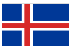
Government of Iceland