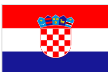
Government of Croatia