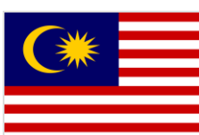
Government of Malaysia