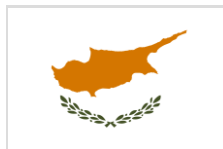
Government of Cyprus