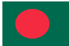
Government of Bangladesh