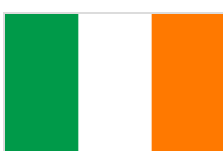
Government of Ireland