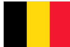
Government of Belgium