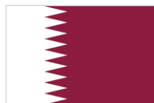
Qatar Fund for Development