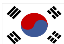
Government of Republic of Korea