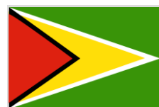
Government of Guyana