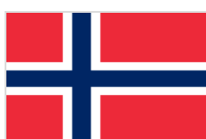
Government of Norway