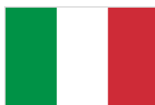
Government of Italy