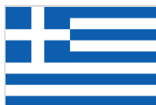
Government of Greece