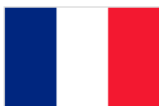
Government of France