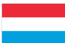
Government of Luxembourg