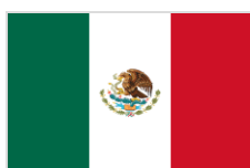
Government of Mexico