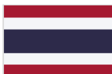
Government of Thailand