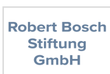
Robert Bosch Stiftung GmbH