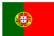
Government of Portugal