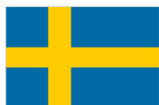
Government of Sweden, Sida