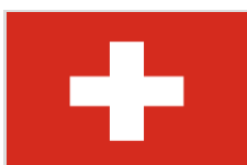
Government of Switzerland, Swiss Agency for Development and Cooperation, Government of Switzerland