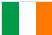
Government of Ireland, Irish Aid