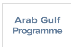
Arab Gulf Program for Development