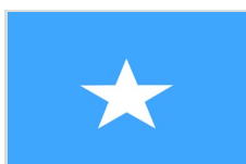
Government of Somalia