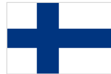
Government of Finland