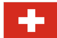
Swiss Agency for Development and Cooperation, Government of Switzerland