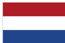
Government of Netherlands