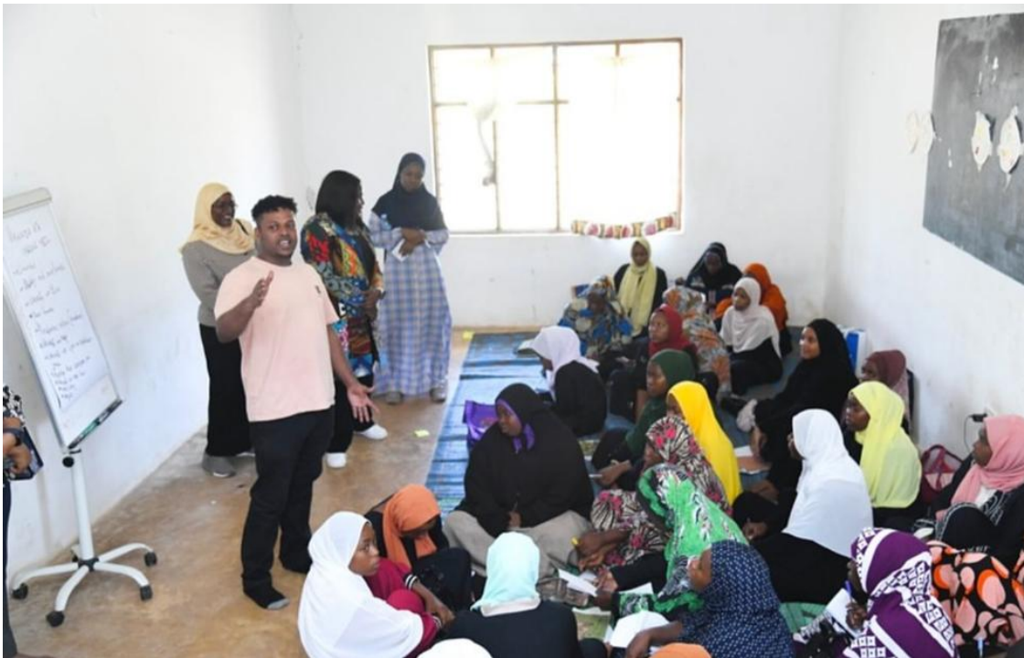
Photo: Group of Women from remote communities receives entrepreneurship Training at Barefoot College, Kinyasini North A District, Zanzibar: Courtesy of UNFPA