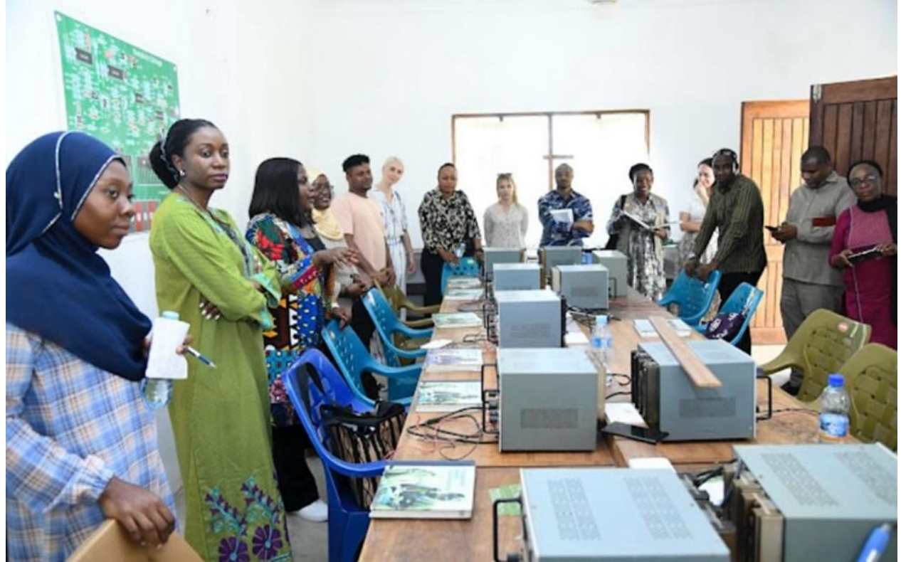
Photo: Members of the DPG (MCDGWSG, MCDGEC, UNFPA, UN Women, UNICEF & WB) - Gender Equality mission inspecting a solar panel assembly workshop at Barefoot College.

The mission focused particularly on Women's Economic Empowerment (WEE) and the implementation of the National Plan of Action to End Violence Against Women and Children (NPA-VAWC). What emerged was clear evidence that integrated approaches linking economic empowerment with social protection and GBV prevention are yielding results.