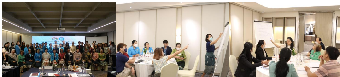
International Conference on Prevention and Response to Violence Against Women in ASEAN Report, 23 September 2022

These efforts have established a stronger legal framework, positioning Lao PDR towards gender equality and the eradication of GBV. In September 2022, an international conference on preventing and responding to Violence Against Women (VAW) in the ASEAN region was held, involving 181 participants and highlighting eight international best practices. Three practices were integrated into the justice response framework, demonstrating a commitment to evidence-based practices.