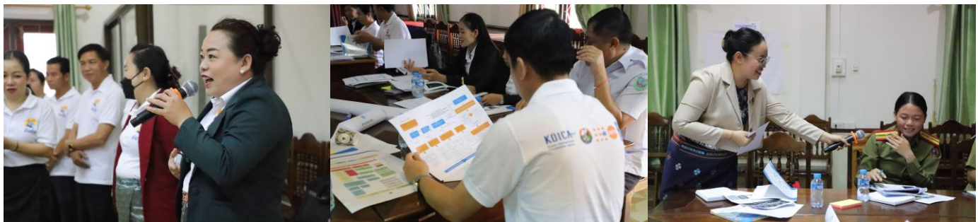
Justice SOP Master Trainers delivered Cascade Trainings in Bokeo and Savannakhet on 20-21 March and 3-4 April 2024

The ToT was designed to improve the skills and knowledge of key personnel from various justice institutions. This initiative was crucial to ensure that these institutions could effectively implement the Justice and Policing Standard Operating Procedures (SOP), training 29 master trainers, 69% of whom were female who gained significant knowledge and proficiency in the subject matter. This was followed by Cascade Trainings in Bokeo and Savannakhet, ensuring the continued dissemination of knowledge and skills acquired during the Training of Trainers (ToT) Workshop, thereby reinforcing the capacity of stakeholders within the justice and policing sectors. By extending the reach of SOP training to additional regions, UNDP facilitated widespread adoption and implementation of SOP protocols, fostering a culture of adherence to standardized procedures across various jurisdictions. Moreover, the Cascade Trainings served to deepen understanding and proficiency among a broader audience, promoting long-term sustainability in the application of SOP principles and methodologies.