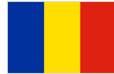
Government of Romania