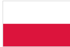
Government of Poland