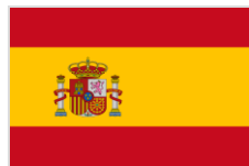
Government of Spain