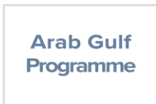
Arab Gulf Program for Development