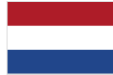
Government of the Netherlands