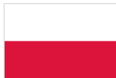
Government of Poland