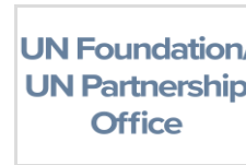
UN Foundation/ UN Partnership Office