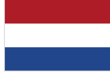
Government of the Netherlands