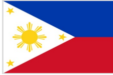
Government of the Philippines