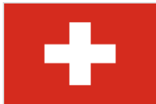
Government of Switzerland