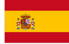
Government of Spain