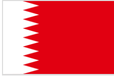
Government of Bahrain