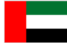
Government of United Arab Emirates