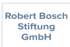
Robert Bosch Stiftung GmbH