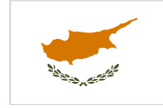
Government of Cyprus