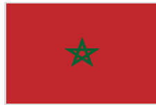
Government of Morocco