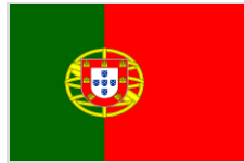
Government of Portugal