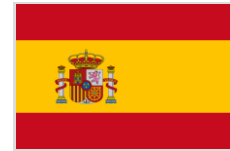
Government of Spain