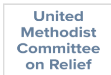
United Methodist Committee RfI