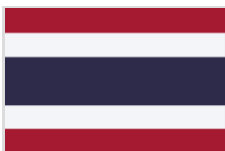
Government of Thailand