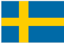
Sida – Government of Sweden