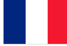
Government of France