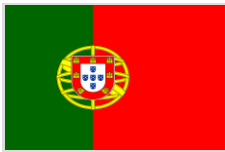
Government of Portugal