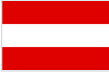
Government of Austria