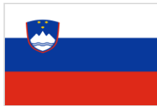
Government of Slovenia