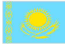
Government of Kazakhstan