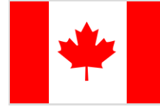
Government of Canada, Government of Canada (Former CIDA)