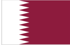
Qatar Fund for Development

(Foreign, Commonwealth & Development Office, Former DFID)