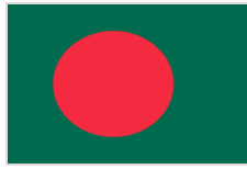
Government of Bangladesh