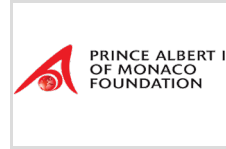
Prince Albert II of Monaco Foundation