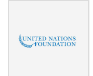
UN Foundation/UN Partnership Office