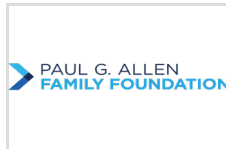
Paul G Allen Family Foundation