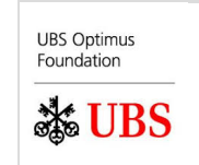
UBS Optimus Foundation