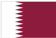
Government of Qatar