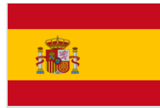
Government of Spain