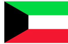
Government of Kuwait