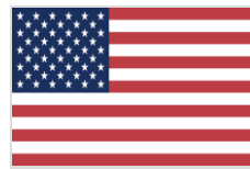
Government of the United States of America (USAID)