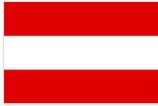
Austrian Development Agency