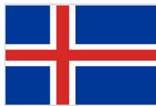
Government of Iceland