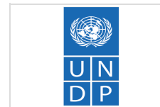
UNDP (United Nations Development Programme)