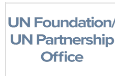
UN Foundation/UN Partnership Office