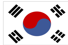
Government of Republic of Korea