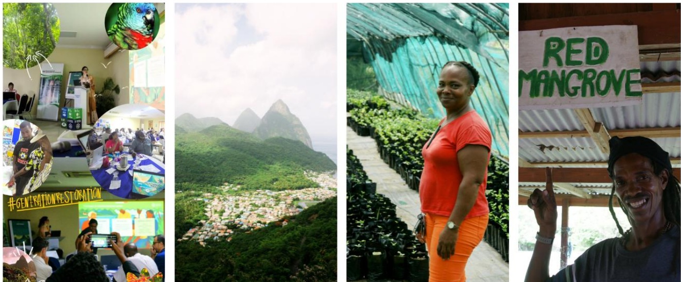
Photo 6: The launch of the SIDS Flagship (and introduction to the Restoration Factory & FERM ), July 2025 in Saint Lucia (left) and imagery from visiting eco-enterprises along the South-East Coast.

Key results achieved in Saint Lucia in 2025 included: