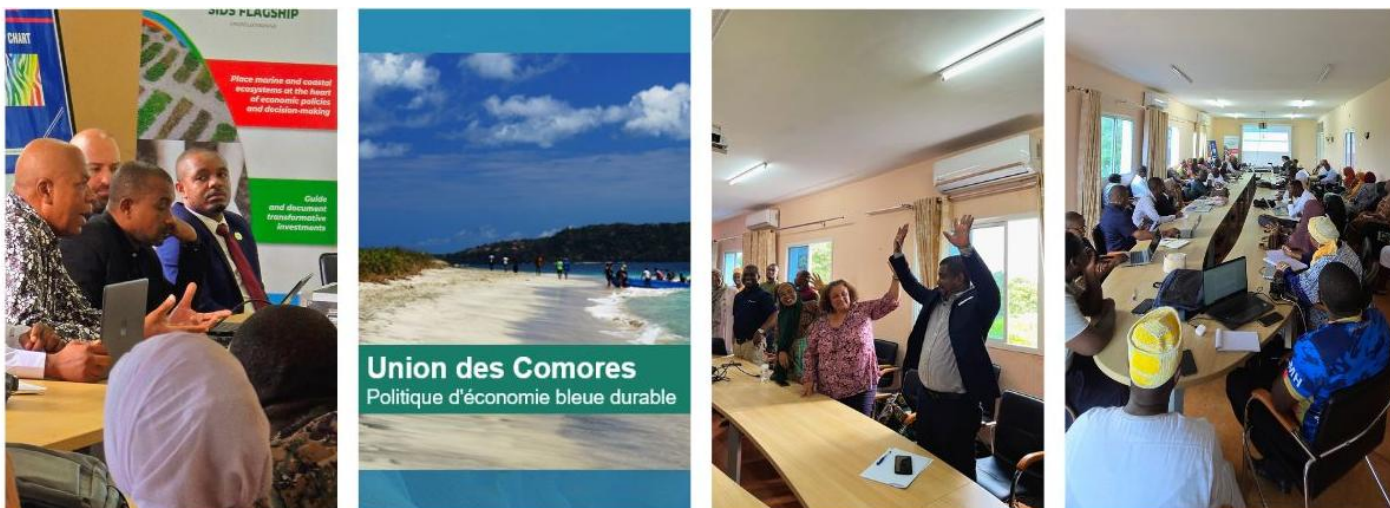
Photo 5: Discussion and deep exchange among stakeholders and Ministries, led by the Minister of Environment and Tourism, Abubakar Ben Mahmoud (left); and the room in ovation (third from left) as the Secretary General closed the successful technical validation of the Sustainable Blue Economy (SBE) Policy.

This milestone represents structural embedding restoration and SBE transition at the highest policy level and strengthening the enabling environment for long-term restoration initiatives, couched in a Sustainable Blue Economy transition.