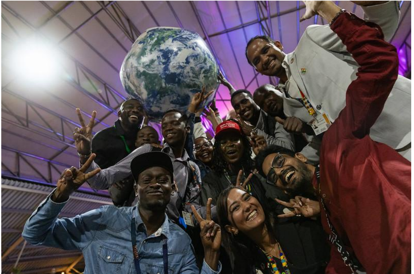
Photo 1: Participants celebrated three new UN World Restoration Flagships at a packed Gala of Hope at the UN Environment Assembly

Public engagement platforms, including the Ecosystem Restoration Hub and pledge campaigns, further enabled participation throughout 2025, resulting in over 10,000 individual pledges. Together, these efforts demonstrate how increased awareness is translating into tangible action—mobilizing stakeholders, strengthening partnerships, and contributing to the scaling of restoration globally.