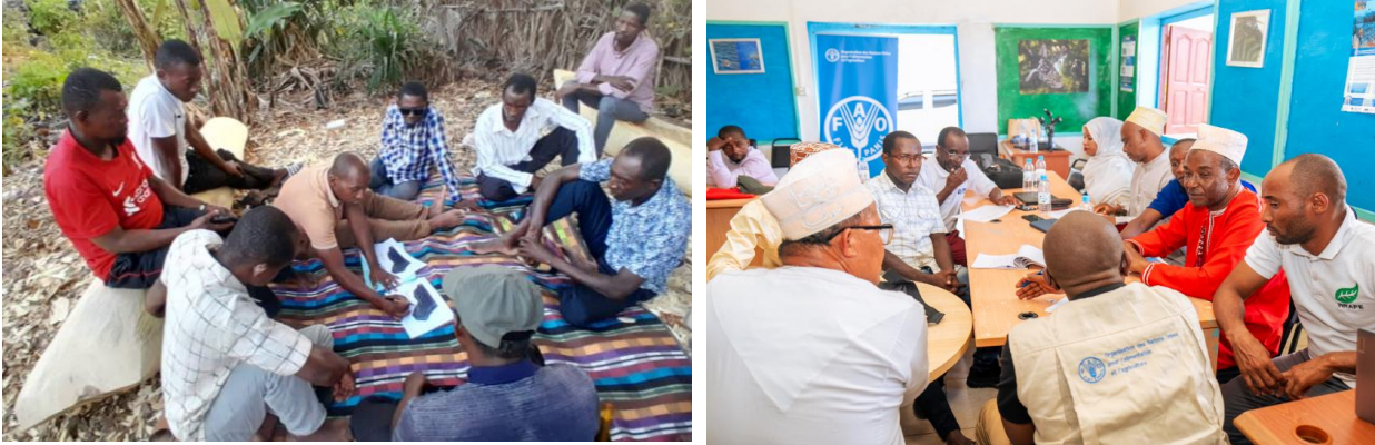
Photo 3: Stakeholders from fisher and user-groups, park management and local community leaders in consultations and participatory-planning and mapping exercises for the Coelacanth National Park's Marine Spatial Plan and validation.

Key results achieved in Comoros in 2025 included: