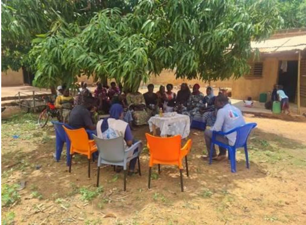
Photo 8: July 2025, Exchanges with a cooperative in the municipality of Korsimoro for the selection of beneficiaries for income-generating activities (IGA) subsidies, under the 2025 budget (YELEMOU F.S)