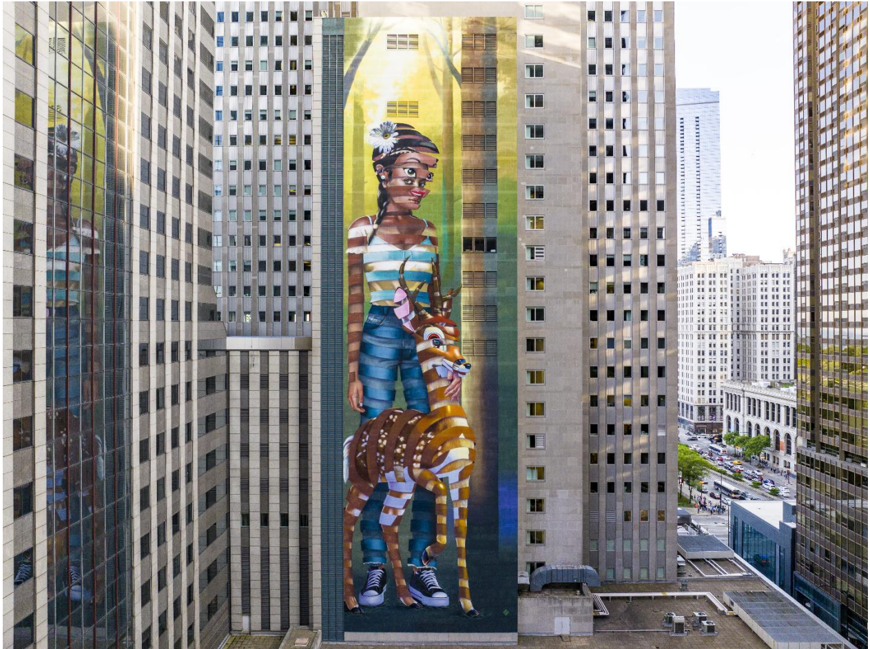
Photo 2: The highest ecosystem restoration mural yet draws attention to the importance of forests for cities. It includes Illinois's state animal, and accompanying information (plaque, QR code and app) highlight the forests surrounding Chicago. (Artist: Super-A)

Output 1.2: Science Communication and advocacy: Best practices for on-the-ground restoration of ecosystems collected and showcased globally, to shift perceptions and increase uptake by, support to restoration initiatives