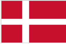
Government of Denmark