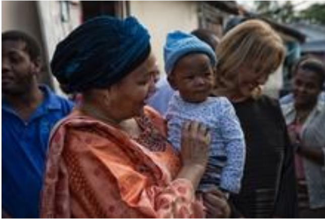
November 2017 Port-au-Prince, Haiti