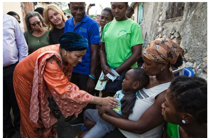
Deputy Secretary-General Amina J. Mohammed and Secretary-General's Special Envoy for Haiti, Josette Sheeran visiting Haiti in November 2017