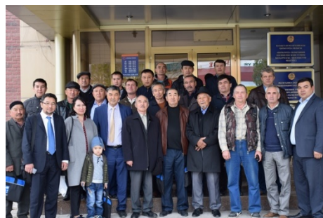
First Forum of Bee-honey producers

UNDP has supported honey production in Kyzylorda region by initiating a creation of the association of honey producers, SyrBaly, which is well-placed to provide honey producers a platform for experience exchange, practical cooperation, training opportunities, serve as an instance for agricultural subsidy eligibility, and to establish foothold in the market. The region has not been well-known for its honey production, yet serves as home for more than 60 producers of organic honey unique in the country, made of camel thorn and consisting healing properties. The first ever Forum of beekeepers in the region was hosted in 2016 with support of the akimat Regional Chamber of Entrepreneurs. A regional development programme of beekeeping is underway. 3