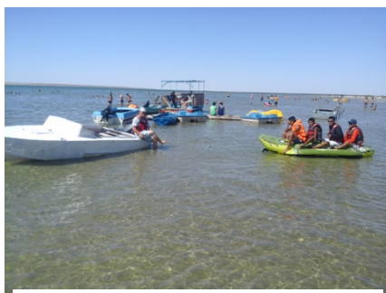
Recreation place on Kambash lake, Aralsk region

Small business development and support, specifically in rural areas, enhancing diversified economic growth has been a key priority for the UNDP under this output. Collaboration with Support of Initiative NGO concretized into 25 business projects receiving interest-free loans, resulting in 45 jobs for rural citizens, including 4 persons with disabilities. Additionally, more than 1500 people have benefitted from business consultation during the last two years. Among successful projects were a dumpling shop, fish processing shop, dentist room and a tourist recreation centre, all in the rural areas of Kyzylorda region 2 .