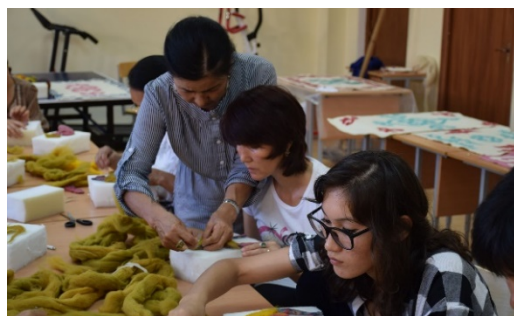
Training for unemployed women in Aral region

Another area of evolving business for the region is production of souvenirs and authentic goods, which is gradually developing and quality and variety improving through trainings and master classes 4 , e.g. UNESCO-supported ceramic pottery training and traditional felt techniques for rural women using local and imported raw materials for production 5 . The trainings aim also to ensure preservation and transmission of traditional craftsmanship. UNDP has assisted in discovering sale opportunities for local artisans through public fares, exhibitions and other business platforms. 6