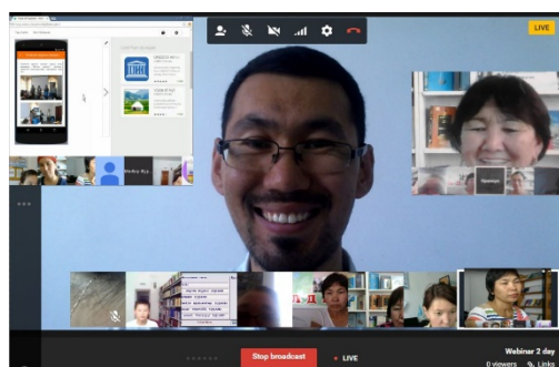
Participants of the webinar-trainings

In collaboration with the local department of education UNFPA conducted education courses on protection of sexual and reproductive health, including issues on prevention of unwanted pregnancy and HIV/AIDS transmission piloted in 14 state colleges of the region and was attended by more than 2500 students. A sociological study to assess the effectiveness of the courses and the gained knowledge of the young people on conducted reproductive issues will be published and submitted to the ministries and local administration.