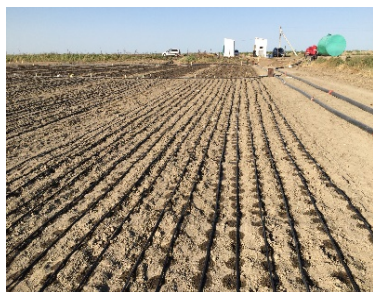
Planting of rice with application of drip irrigation

UNDP piloted water saving technologies in irrigated agriculture, particularly rice farming and the cultivation of melons Kyzylorda region with the use of drip irrigation to save water for rice for breeding purposes and the preservation of the gene pool and growing melons was continued. In addition, the beneficiaries received two sets of water pumps for the drip irrigation systems.