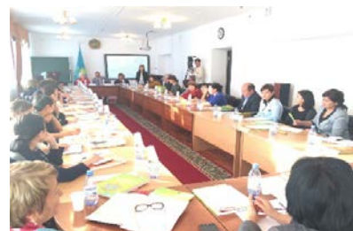
Scale up meeting of the school-based violence prevention programme

To enhance the system of protection from violence and access to justice, UNICEF together with Ombudsman’s office for Human Rights conducted a study on Knowledge, Attitudes and Practices in the field of domestic violence and justice for children (KAP), identifying prevalent social norms, attitudes and practices of children, adults and professionals on domestic violence and justice for children. The findings are used to inform public policy dialogue, to support the development of policies and programs, and to develop communication initiatives on the rights of children and prevention and elimination of violence against children. In the area of domestic violence, the research revealed major knowledge gaps. Alarming, more than 70% of general public support the use of corporal punishment to discipline and control children in the family. Over 95% of general public and child protection specialists believe that it is strangers who are likely to sexually abuse children (rather than relatives or acquaintances). UNICEF together with partners is developing policy briefs for advocacy with policy makers on the issues raised.