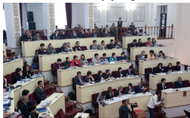
National Primary Health Care Conference, December 2016

At the health service level, following the WHO assessment of the capacities of health service providers to communicate to their patients and engage population in behaviours that will contribute to improved health, prevent further disease and contribute to rehabilitation major systemic barriers of access to health providers were addressed. Trainings in managerial capacities, financial and HR planning, and in organizational level monitoring were