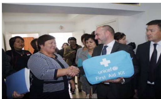
Transfer of bags for patronage nurses by the Deputy Representative of UNICEF, Fiachra McAsey to the chief physician of pilot polyclinic No. 1 of Kyzylorda city.

With support of UNFPA a Kyzylorda branch of National Y-Peer Network was established in 2015. Two resource centres for Young People were equipped and opened, one in Kyzylorda City based at the Humanitarian College and another one in Shiyely District of the region. Both Centres are being used by Y-Peer activists and volunteers for providing training on leadership and communication skills as well as on protection of reproductive health using Peer-to-Peer approach. In conjunction with above mentioned training at colleges of the region on protection of reproductive health, in long run time these would lead to improvement of reproductive health status of young people by increasing of healthy life styles and safe behaviours, reduction of unwanted pregnancies, abortions and STIs, including HIV.