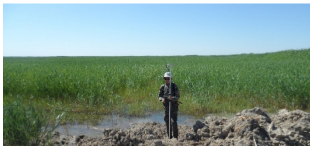
Land surveying works at the "Bes Zharma" Channel of Rayim Rural County

Barsakelmes biosphere reserve, which is a pilot site for a sustainable development where application of sustainable development principles is built on collaboration between scientists,