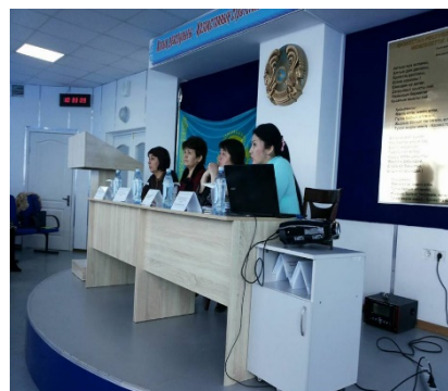
Briefing session of Health Department for local media

UNICEF strengthened the capacities of local media and akimat in covering child rights situation in the region and applying ethical norms. Local media were actively highlighting child issues and three media outlets demonstrated an improved understanding of the child rights situation with ethically correct representation of information. The department of internal policy under city akimat and the regional department of internal policy started broadcasting news and information on children. Akimat also shared information through social media, and the health department organized a press briefing on the ethics of covering children's issues. To increase the awareness of the local population on the commitment of the city to create child-friendly conditions, a CFC billboard was located in city centre by the akimat.