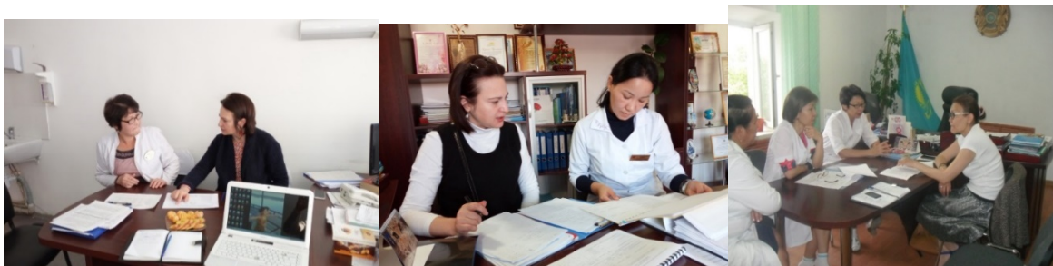
Quality improvement and strategic planning implementation in pilot PHC facilities

A multi-disciplinary WHO expert team conducted a national and oblast level assessment of health services provided for patients with chronic non-communicable diseases. An analysis of the national strategic and programmatic documents, financing of health services for better care and treatment of NCDs, organization of patient care from primary health care, through specialized care and rehabilitation, focus on integrated prevention at primary, secondary and tertiary level and rehabilitation stage have been carried out. The key diseases on which focus was made were diabetes mellitus and stroke. The assessment has shown the need for training of health professionals, and organizing services for inclusion of prevention and counselling on risk factors at PHC, but even more so at secondary hospital level when patients are already affected. The need for adaptation of services to gender specificities have been identified and specific recommendations made.