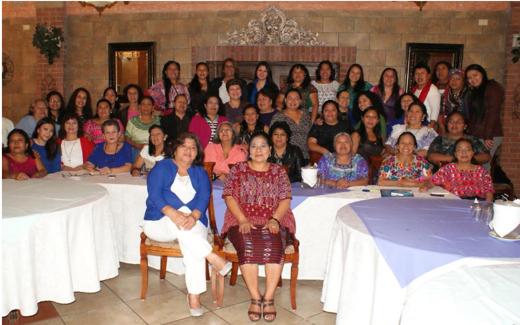
Fotografía de Asamblea del Foro Nacional de la Mujer, Noviembre del 2016