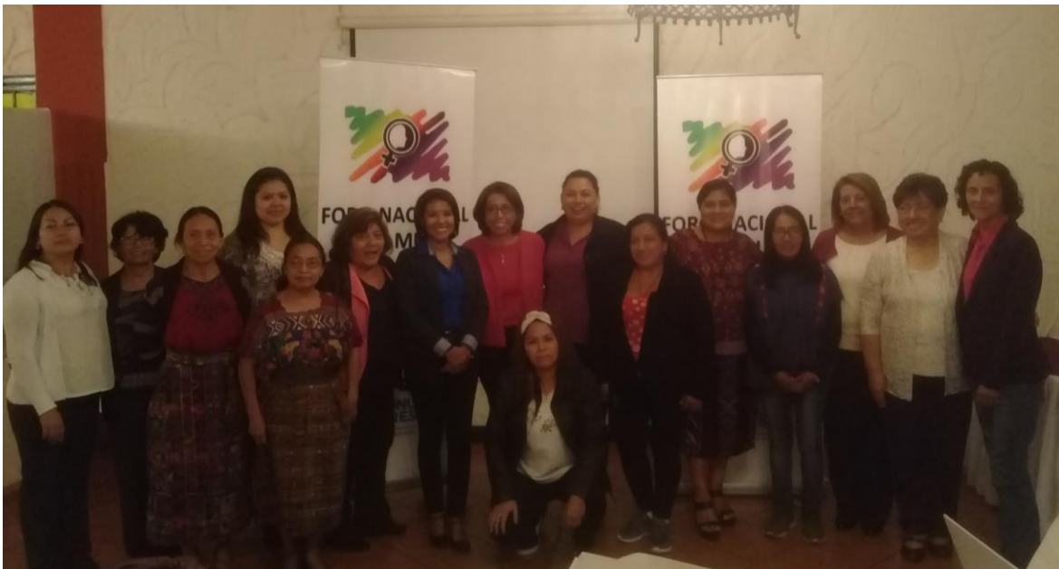
Reunión Ordinaria de la Comisión Coordinadora Nacional del Foro Nacional de la Mujer Noviembre del 2017