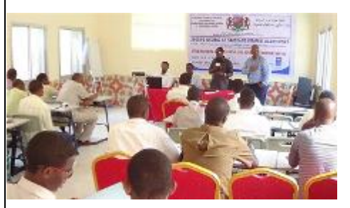
Pic 2. A Dialogue Forum in in Baidoa.

Decentralization Dialogue Forums 24-25 July, Kismayo, Jubbaland 26-28- September, Badaio, SWS 26-27 November, Garbaharay