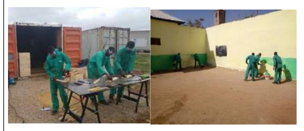
UNIDO plastering and painting skills training at the Baidoa Central Prison. Containerized training platform for woodworking (beehive box making)

Some of drought response the beneficiaries received their CFW payment in Baidao - South West state