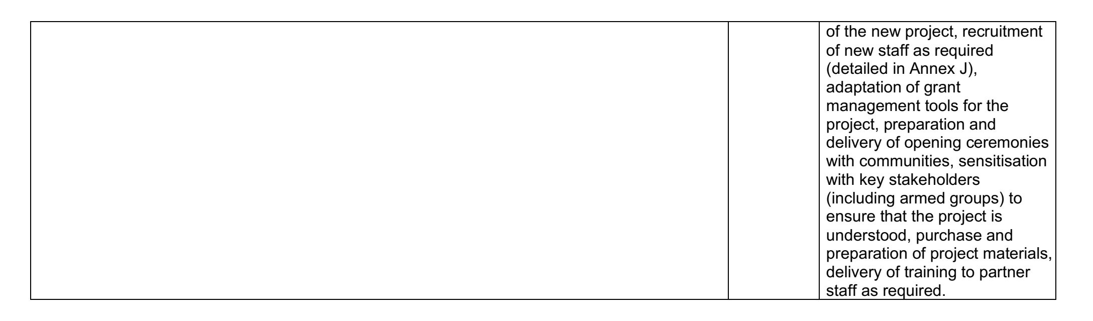
Annex D: Detailed and UNDG budgets (attached Excel sheet)