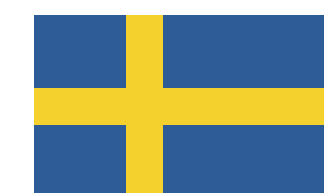
Swedish International Development Cooperation Agency