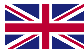
UK Home Office