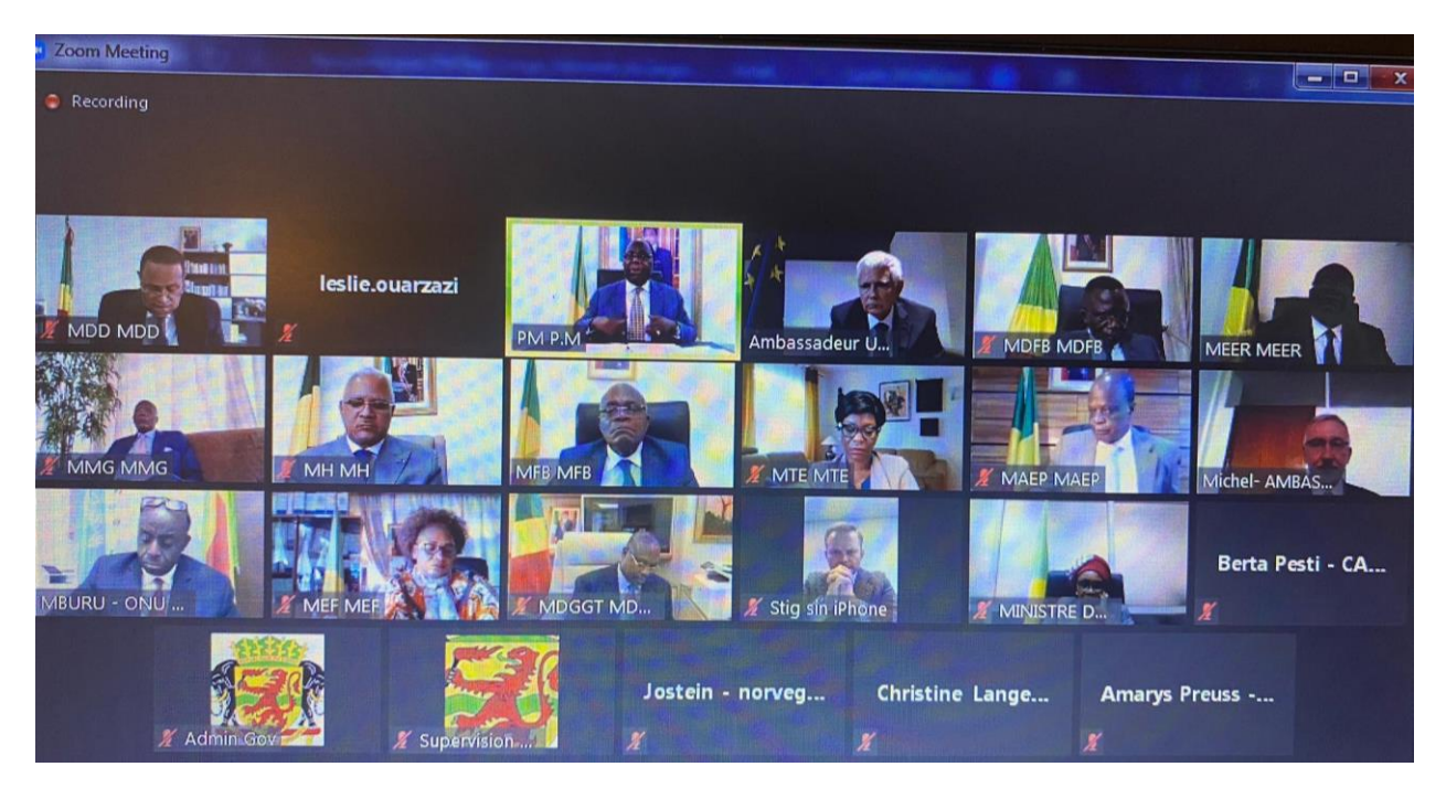
Figure 1: Screenshot of meeting between the members of the Government of the Republic of Congo and the CAFI EB

These events contributed not only to visibility, but also to build strong political commitment from the highest levels of government in target countries, guaranteeing sustainability after projects end through the dedication of national attention, action and resources.