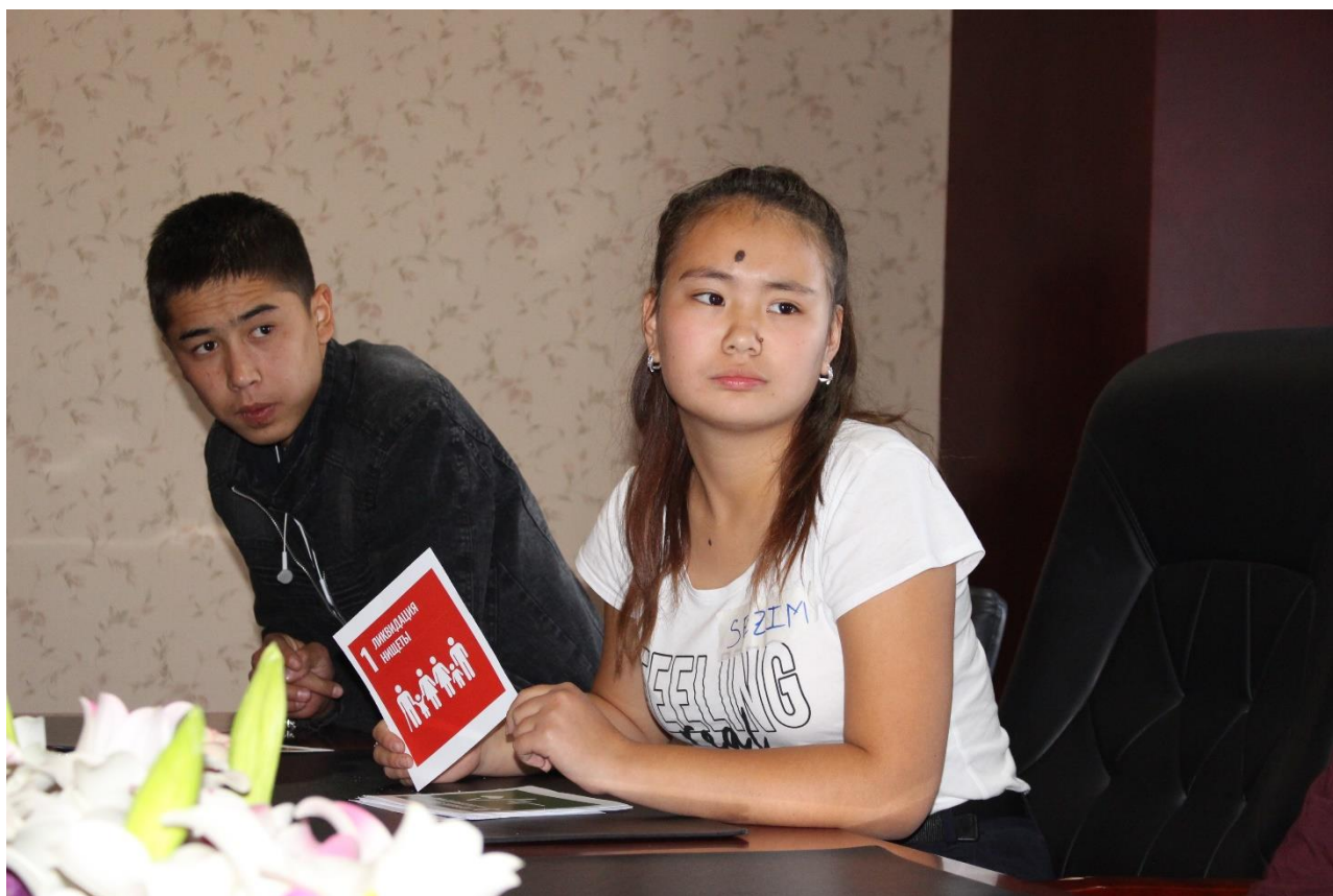
Young man and woman during SDG16+ workshop (October, 2019).