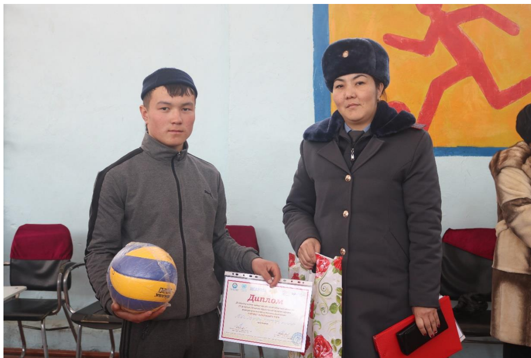
Young man in Taigaraev (Jalal-Abad province) with Juvenile Inspector during the volleyball game between youth and law enforcement agency representatives (February, 2020).