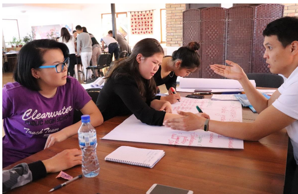
Members of Initiative groups in Chui province during group work at Youth Safe Space Facilitation & Debate Workshop (April, 2019)