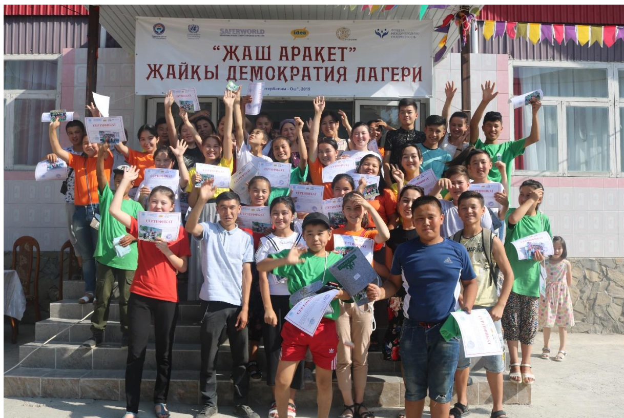
Group photo of young women and men of Kotormo (Batken province) at Democracy Camp (July, 2019).