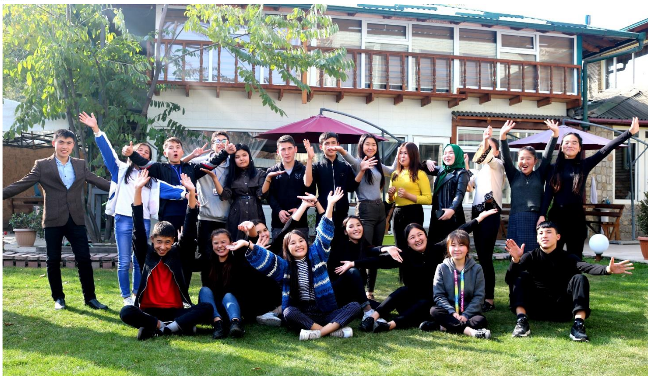
Group-photo of young women and men from southern communities at Advocacy and planning training (November, 2019).