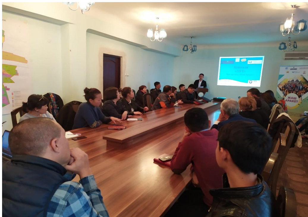
Community talks in Tokmok (October, 2019).