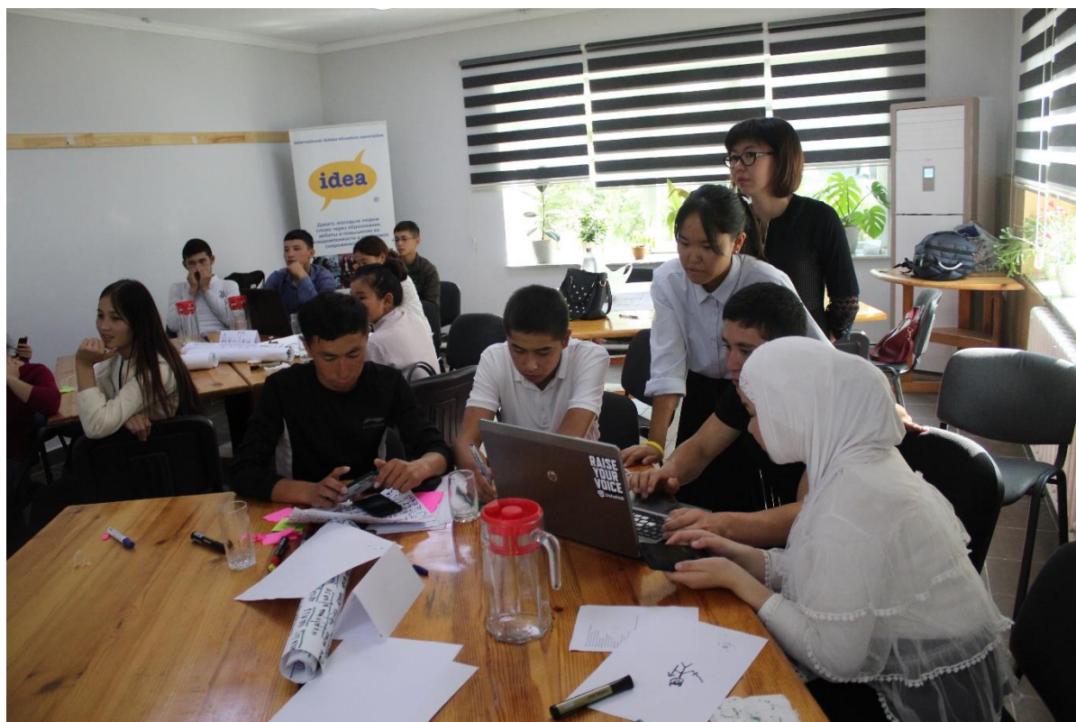
Initiative group members of Osh working during the data analysis of Community Security Assessment research workshop (September, 2019)