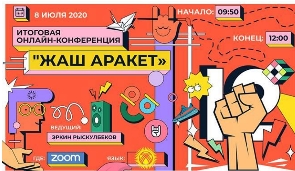
Banner of final closing event for the project, Online via Zoom (July, 2020).