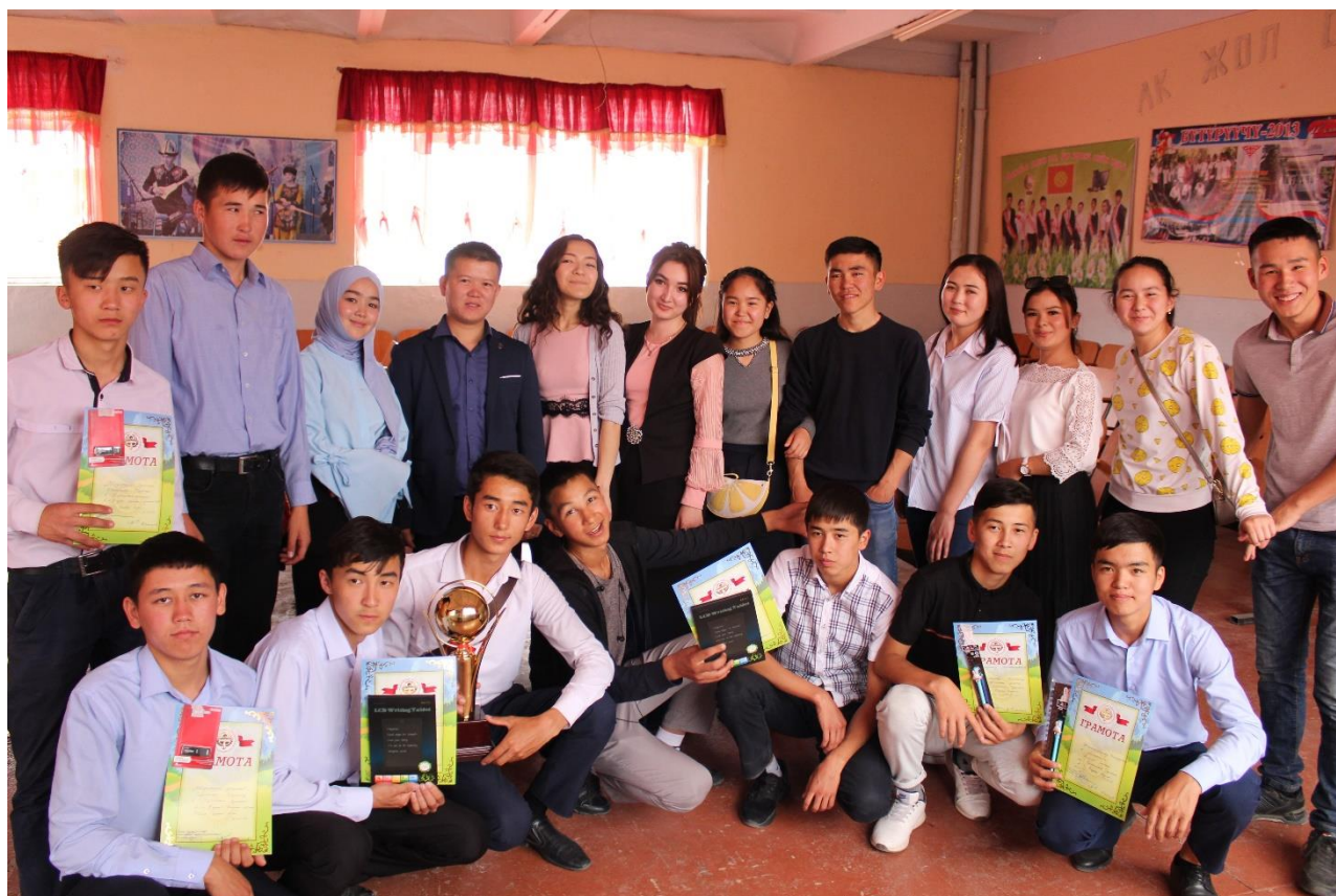
Young women and men during Debate Tournament in Bazar-Korgon (Jalal-Abad province), (May, 2019)