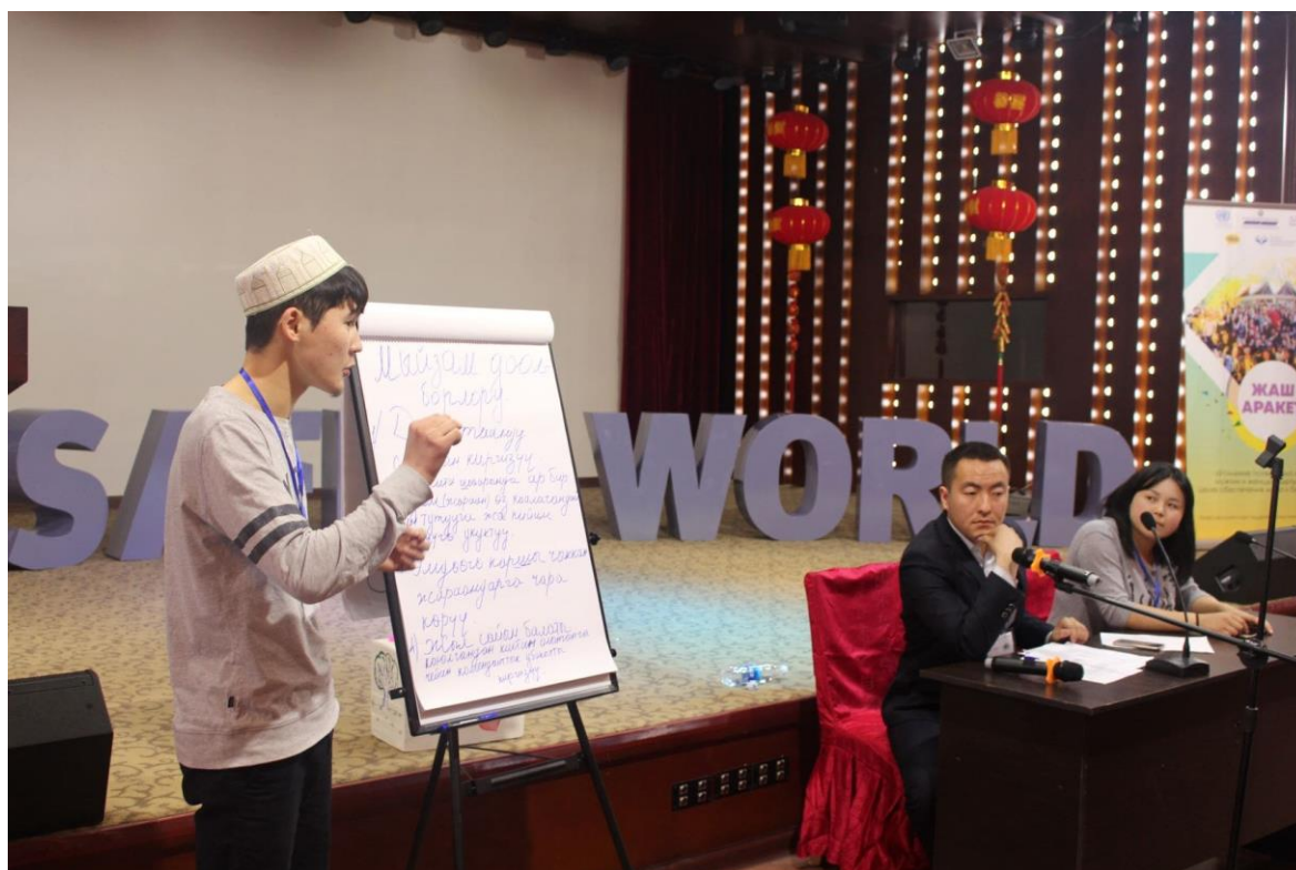
Young men presenting his ideas on tolerance during Youth Camp (March, 2019)