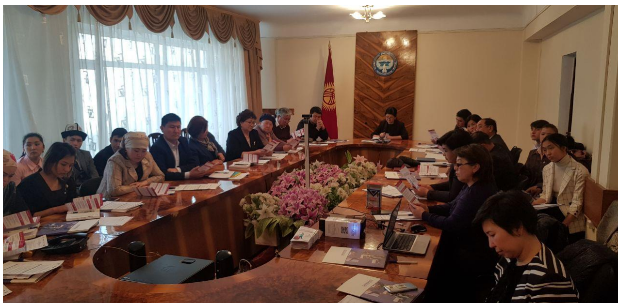
Round table on SDG 16+ target “Safe Migration (10.7)” within advocacy-campaign on sub-national level in Jalal-Abad (March 12, 2020).