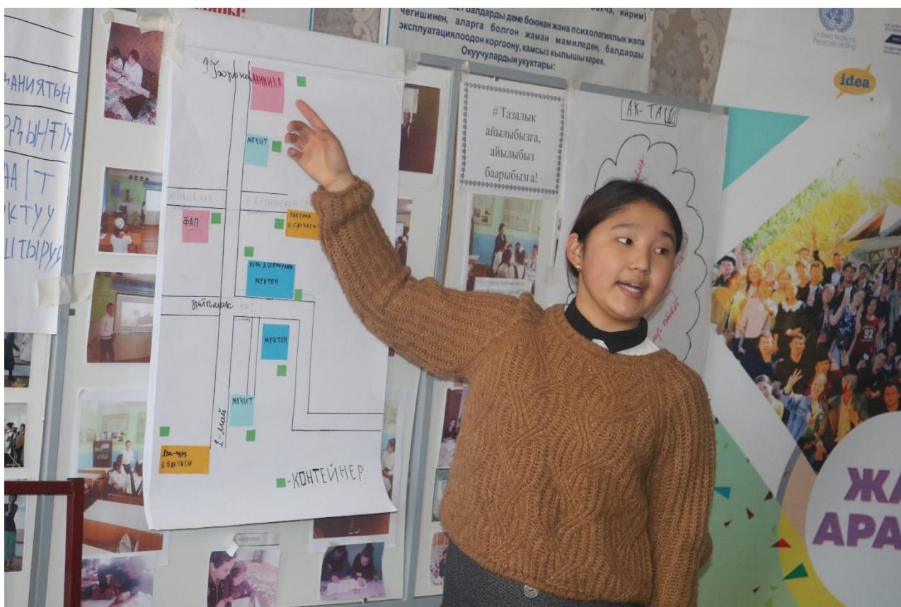
Young woman from Ak-Tash (Osh province) presenting the places where trash cans should be installed during advocacy meeting with local authorities (December, 2019).