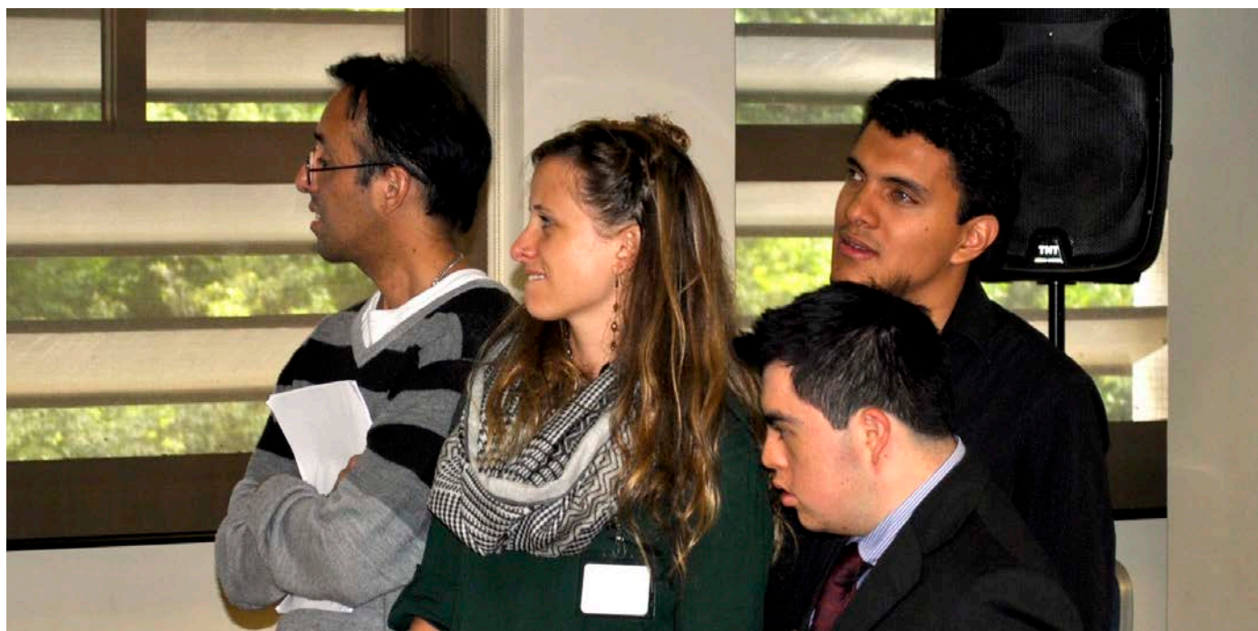
iiDi, UNICEF and IDA side event youth participants