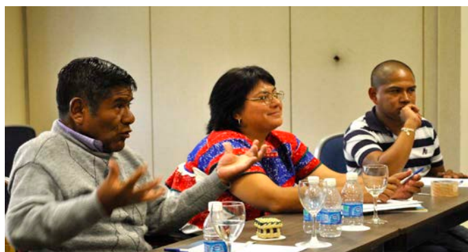
Indigenous Persons with Disabilities Global Network workshop participants