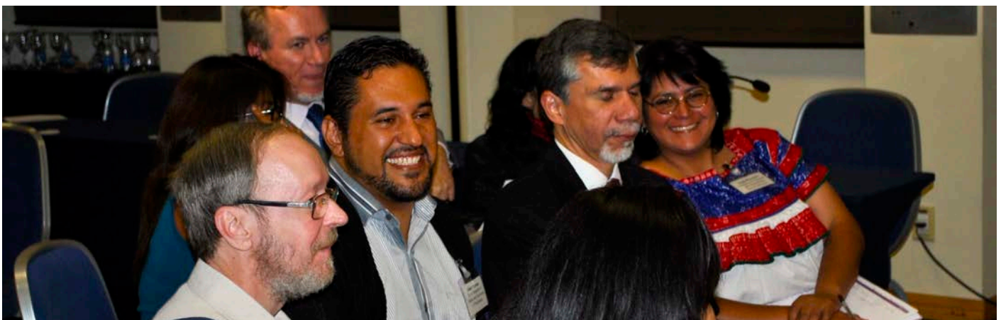
Declaration Drafting Working Group