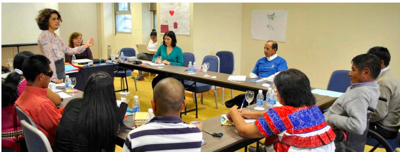
Indigenous Persons with Disabilities Global Network workshop

fundamental actors that have defined roles in rights advocacy: 1) national governments, 2) civil society, 3) UN cooperation agencies.