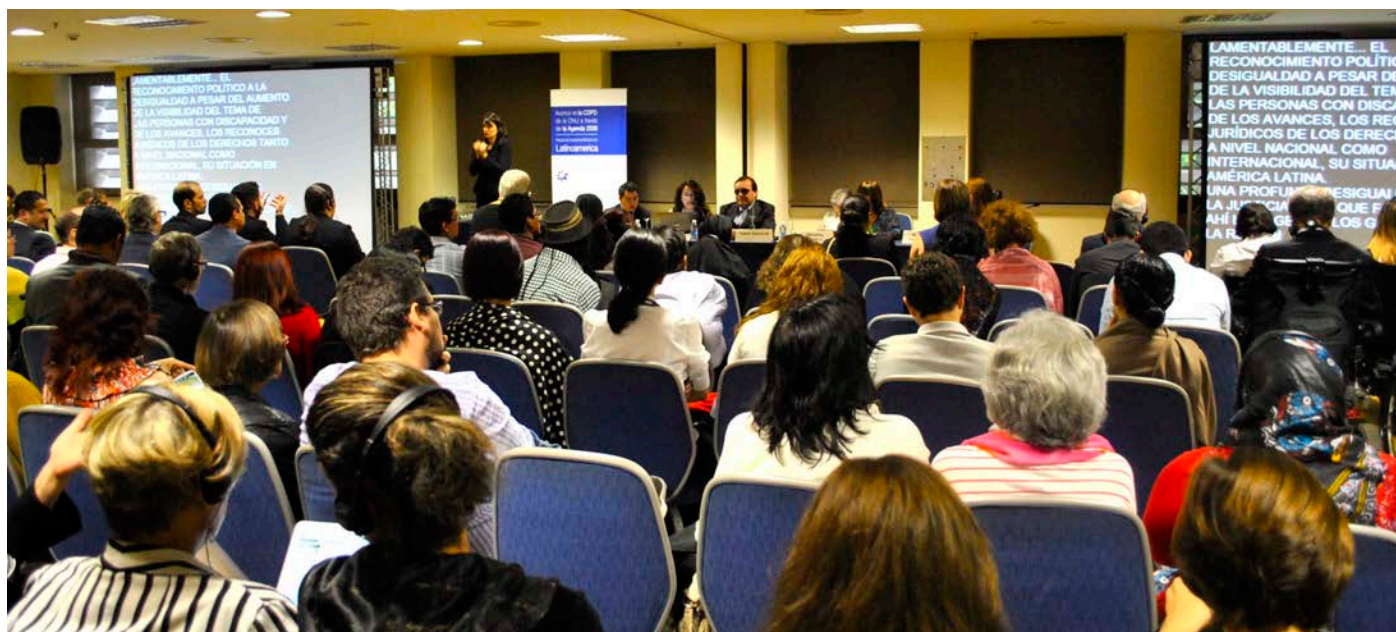
Participants during plenary session of the Sao Paulo Conference

In the discussion, reference was made to the 2030 Agenda, which was approved in New York, and to the importance of working across all aspects of the 2030 Agenda in order to improve implementation of the UN CRPD.