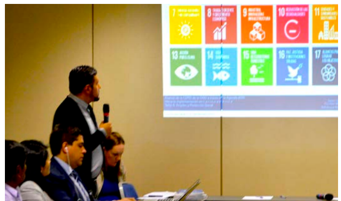
Sao Paulo Conference workshop discussion