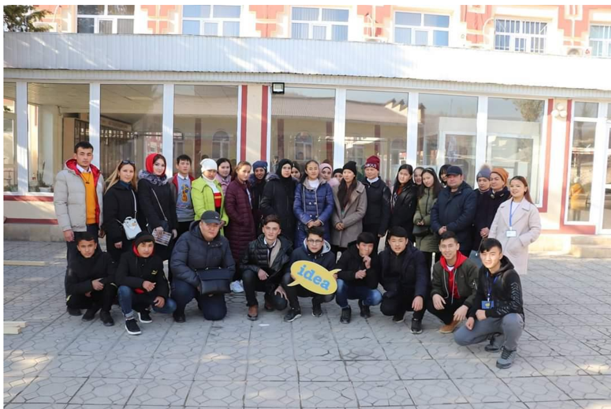
Young people during the tour to the universities of Jalal-Abad organised by Youth leaders of Bazar-Korgon, December, 2019.