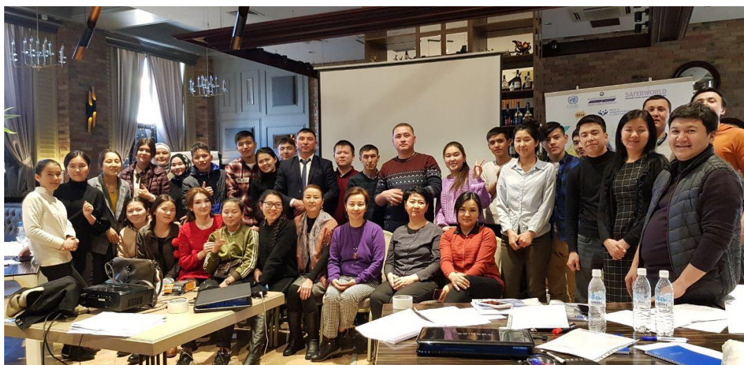
Group photo of youth leaders and local authorities from 7 southern communities, and project team after the SDG16+ advocacy workshop (February, 2020, Osh).