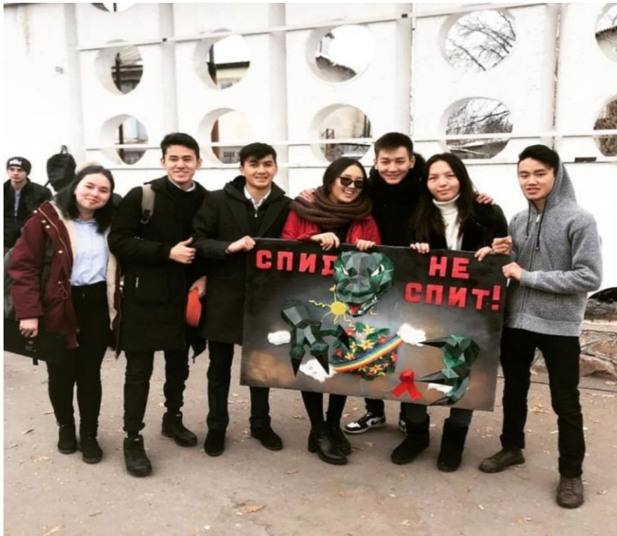
Initiative group of Belovodsk during an action dedicated to International AIDS Day (December, 2019).