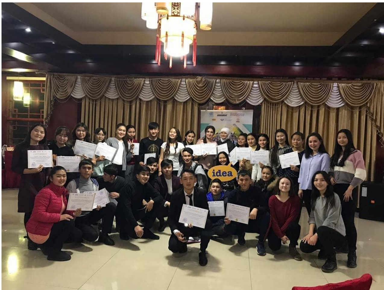
Initiative group members during final training and experience exchange of 2019 in Osh (December, 2019).