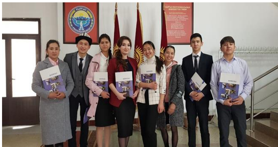
Youth leaders from Jalal-Abad province after the roundtable on SDG 16+ target “Safe Migration (10.7)” (March 12, 2020).