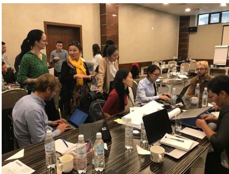
Project team working during Outcome Harvesting in Osh (October, 2019).