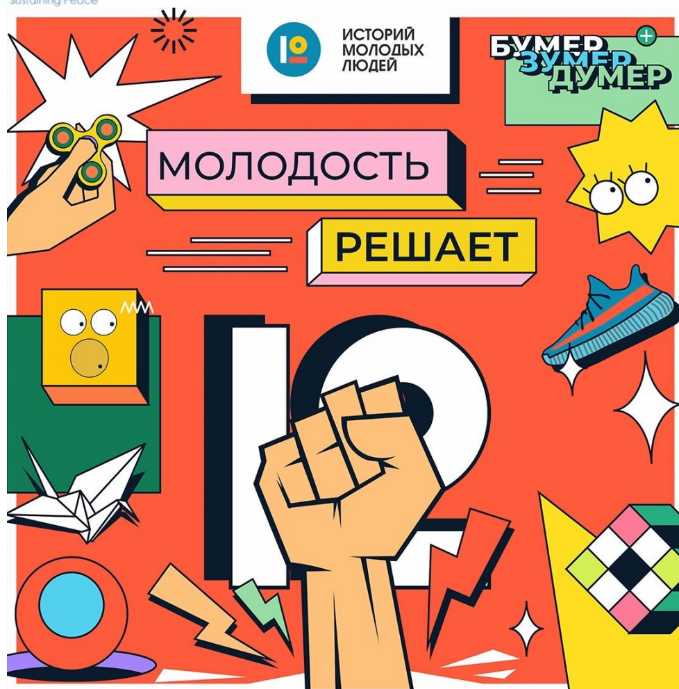
A poster from media-campaign “Youth Decides” https://12storiesofyouth.com/