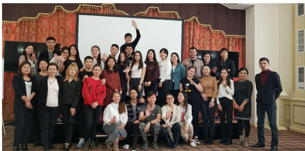
Group-photo of youth leaders of Chui province after the SDG16+ advocacy workshop in Bishkek (February, 2020).