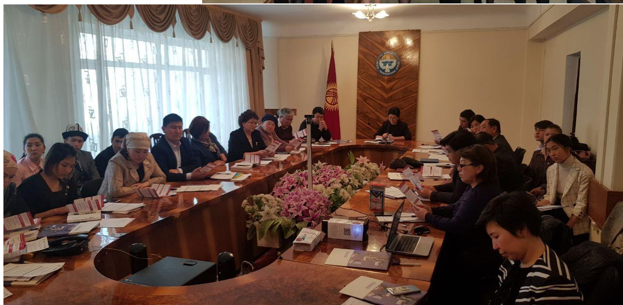
Round table on SDG 16+ target “Safe Migration (10.7)” in Jalal-Abad (March 12, 2020).