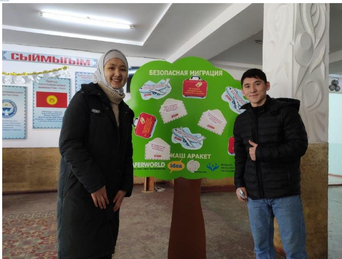
Members of the Initiative group in Osh next to installations about rights of labor migrants. Installations were put in two vocational schools in Osh (December, 2019).