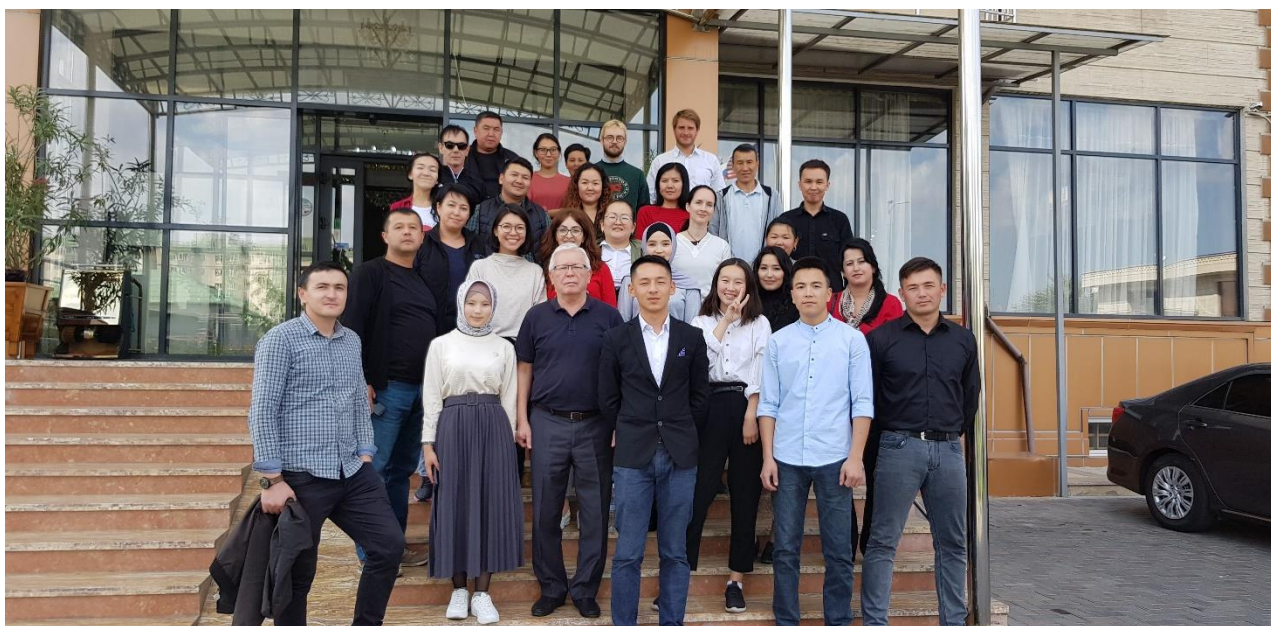
Group photo of some young participants and project team members during Outcome Harvesting in Osh with Saferworld and partners, and UN PBF M&E Specialist (October, 2019)