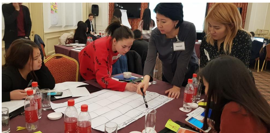
Group work of youth leaders of Chui oblast during advocacy workshop on SDG16+ (February, 2020, Bishkek).