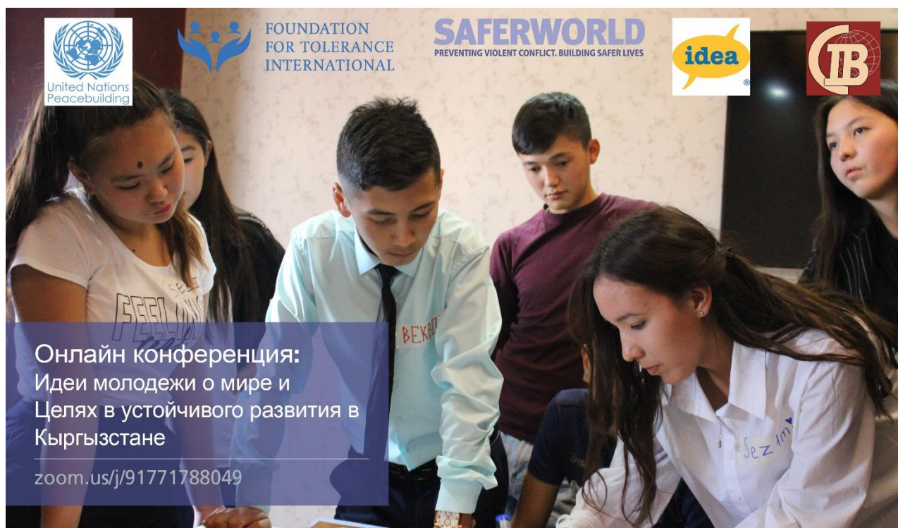
Banner for launch of the SDG 16+ report “Taking stock Young people’s ideas on peace and the Sustainable Development Goals in Kyrgyzstan”. Online via Zoom (May, 2020).