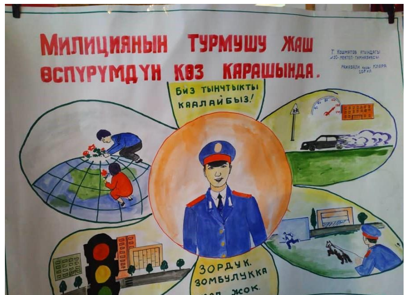
A photo of one of the posters created during a drawing contest in Taigaraev (December 2019).