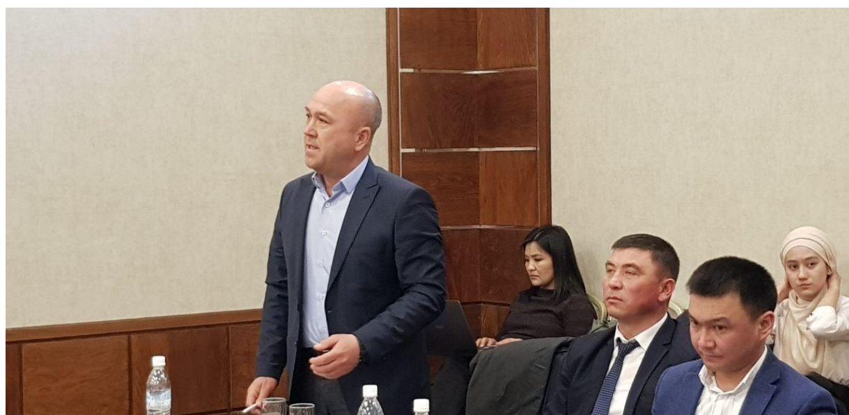
The vice-mayor of Uzgen city sharing his opinion at the round table on SDG 16+ target: “To end violence against children (16.2)” in Osh (March 11, 2020).