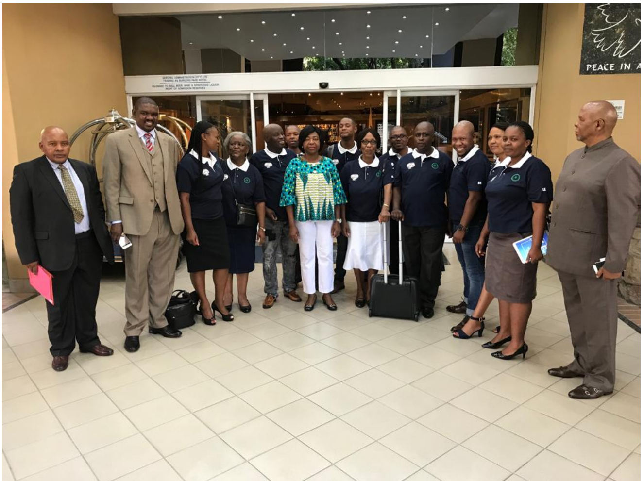
Photo: Members of NDPC and UN staff