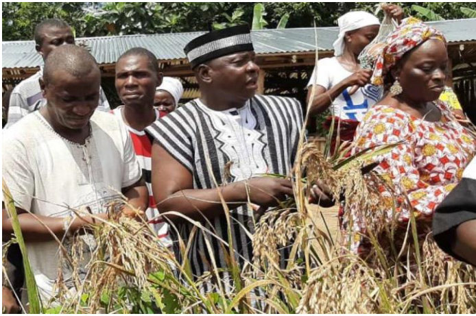
Climate smart agriculture and traditional leaders harvesting their first batch of rice in Sonkey town Montserrado County September 2020

Traditional zoes' capacity in managing agropastoral and business initiatives activities was strengthened through a six-month programme on climate-smart