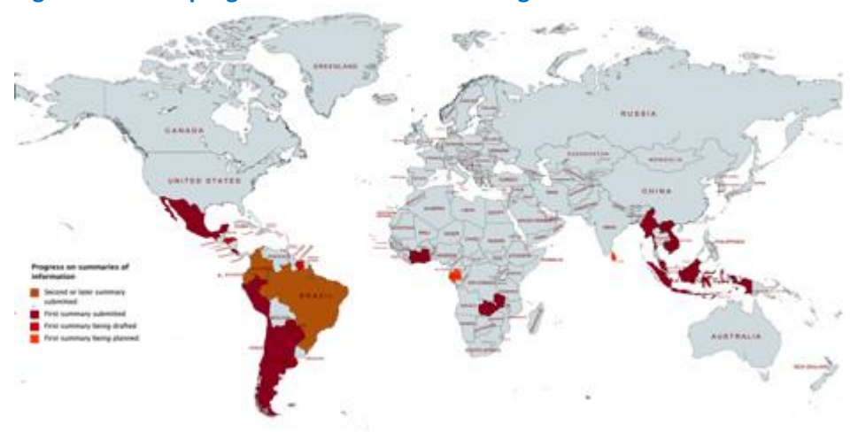
Figure 1. Global progress on summaries of safeguards information at the end of 2020