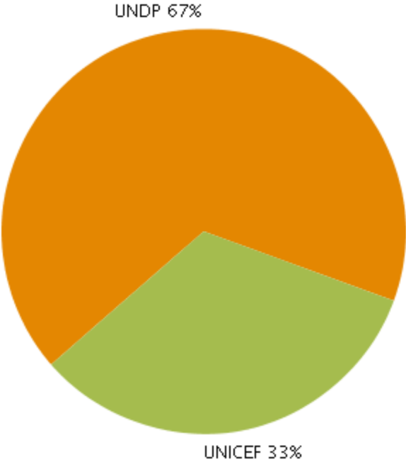
Figure 2: Transfers amount by Participating Organization for the period of 1 January to 31 December 2019