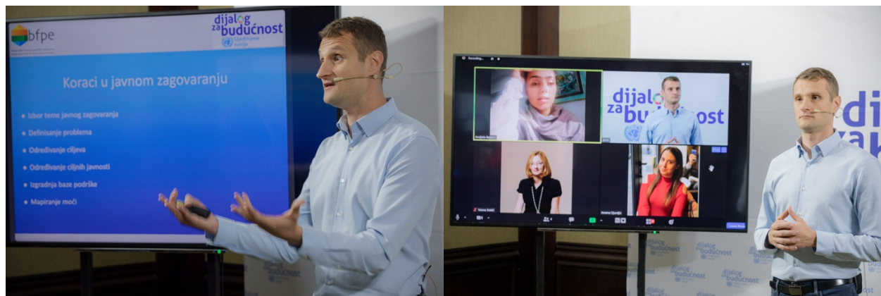
Photos from online learning seminar for women

https://www.grupa484.org.rs/pozivamo-vas-na-skolu-aktivizam-i-druzenje-prijavite-se/