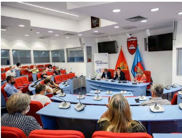
Coordination meeting in Bijelo Polje ; 14 th September 2020;

http://www.bijelopolje.co.me/index.php/arhiva-glavnih-vijesti/5508-kroz-manifestacije-i-radionice-promovisace-suzivot-i-zaednicki-identitet