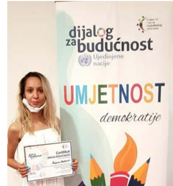
Second and third training for youth as an activity of the project „Umjetnost demokratije,, in Goražde and Banja Luka; 20 th and 24 th August 2020; URL: https://www.instagram.com/p/CEHQa68BFGV/ ; https://www.facebook.com/croabih/posts/2738309026494999