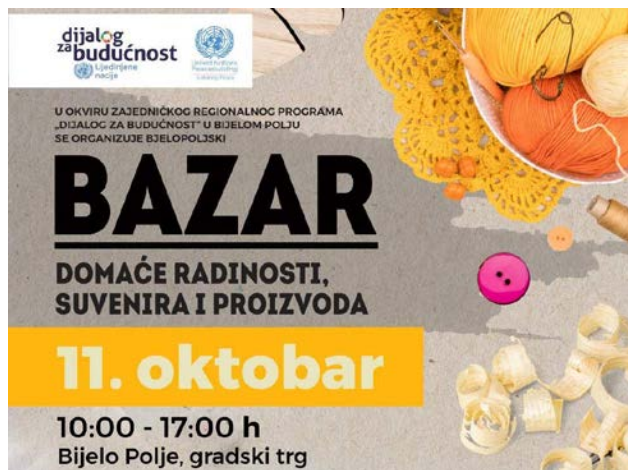
Bazaar (homemade souvenirs and products) in Bijelo Polje,

11 th October 2020; http://www.radiobijelopolje.me/index.php/bijelo-polje/27334-oko-45-izlagaca-iz-crne-gore-i-regiona-na-bjelopoljskom-bazaru