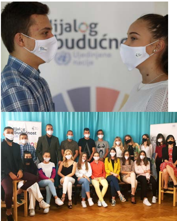
First training for youth as an activity of the project „Umjetnost demokratije,, in Sarajevo; 19 august 2020; https://www.facebook.com/croabih/posts/2733977933594775