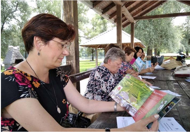
Sightseeing tour of Bratunac, 24 th August 2020;

URL: https://www.facebook.com/permalink.php?story_fbid=2668539063359429&id=1488328698047144