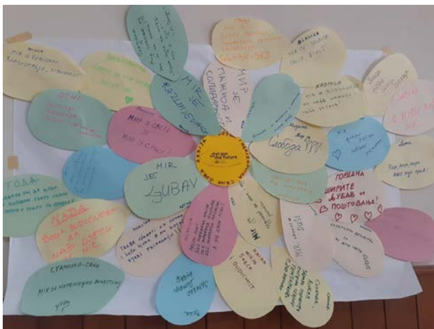
International Peace Day roundtable activity; 20 th September

https://www.facebook.com/Udruzenje-zena-Vila-Ljubovija-112983152535168/photos/pcb.974162559750552/974162326417242