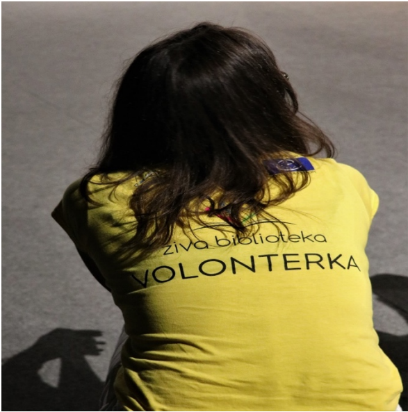
Event: First training for organizers of Living Library in Sarajevo (19-24 September 2020), Sarajevo, Bosnia and Herzegovina