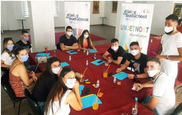
Fourth training for youth as an activity of the project „Umjetnost demokratije,, in Mostar; 26 th August 2020; https://www.facebook.com/croabih/posts/2740429032949665

https://novasloboda.ba/2020/08/26/prvi-trening-za-mlade-sa-podrucja-hnk-a-u-okviru-projekta-umjetnost-demokratije/