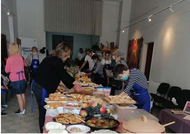
Gastrofest in Ljubovija, 20 th September 2020;

https://www.facebook.com/Udruzenje-zena-Vila-Ljubovija-112983152535168/photos/pcb.974162559750552/974162326417242