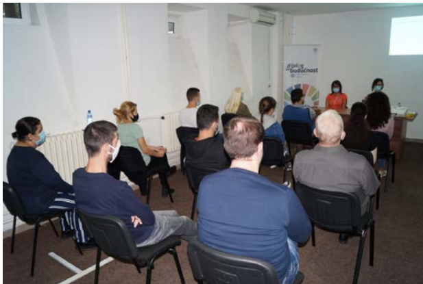
07 th October 2020;

https://ss-cg.org/?p=746&fbclid=IwAR3ahqxN6xDx5X4q-tzQjI4AumvF0w-PMo0nClc-bixJmJZM0CzyeRqO6SI