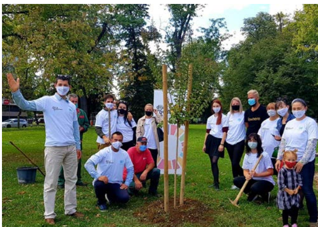
Activity of planting trees in Banja Luka, 07 th October 2020;

URL: https://www.facebook.com/croabih/posts/2778963709096197