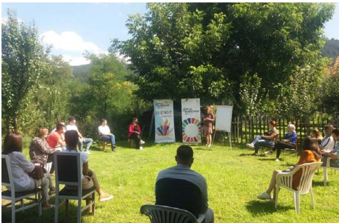
Fifth training for youth as an activity of the project „Umjetnost demokratije,, in Pljevlje (Partner organization Bona Fide Pljevlja, Montenegro); 28 th October; https://www.facebook.com/croabih/posts/2742032792789289