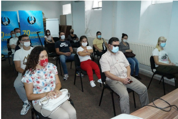
Workshop „Gender and sex, gender equality,,; 23 rd

September 2020; https://ss-cg.org/?p=735&fbclid=IwAR1xQeMz0ePpLq2Xt7gbrijfo1FLZcYrEF-H2pw8LNdg7Dpf0UpT5FIFXKU