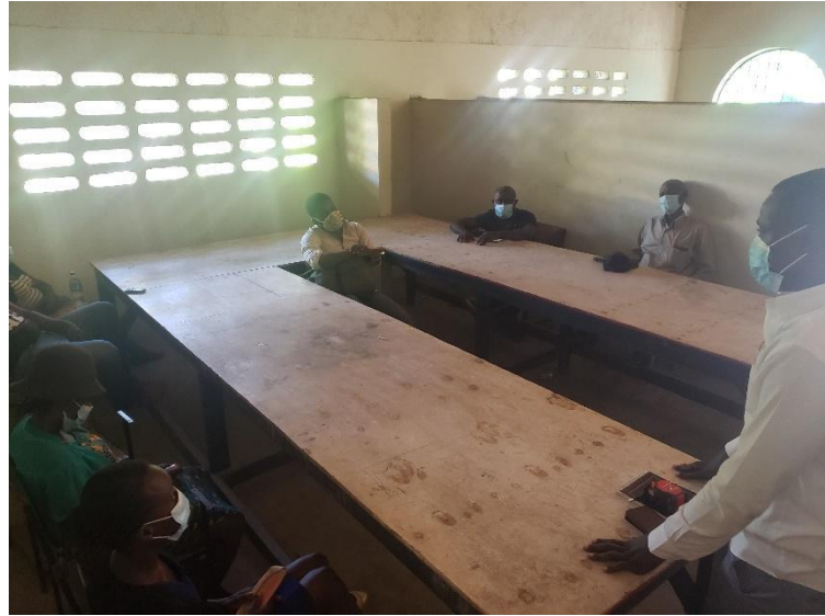
Community\ mobilization\ and\ selection\ process\ of\ platform\ members-Limbe