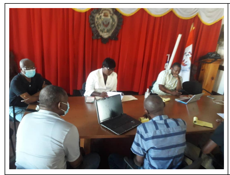
Meeting with the mayor of Cap-Haitien to present the projects selected by the communities and to check if these projects are aligned with the Communal Development Plan - Cap-Haitien Downtown