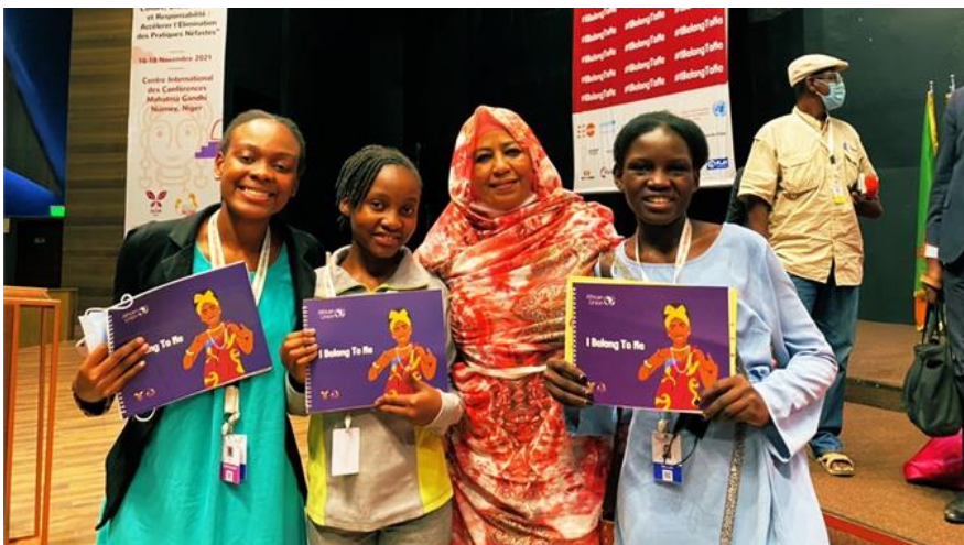
Figure SEQ Figure\* ARABIC 7 Amira ElFadil, Commissioner for Health, Humanitarian Affairs and Social Development, with Girls activists holding copies of I Belong To Me

Book: I Belong To Me is a book directed at children, pre-adolescents and parents, with the objective of generating a conversation within the household about African culture and harmful practices. The book was produced by a team composed exclusively of African Women, in order to preserve the cultural authenticity of the