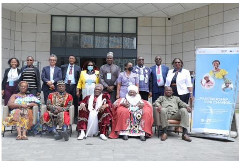
Figure SEQ Figure 1* ARABIC 5 Partnership for Change: Strengthening the role of religious and traditional leaders in ending violence against women and girls, 19 October Addis Ababa