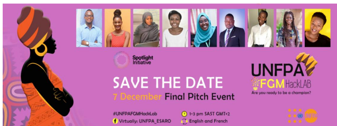
Online invitation for final pitch event, December 2021

The call for ideas solicited 113 applications from young people from 18 countries across the continent, over 60 per cent of which were from young women. A cohort of 18 ideas were longlisted for further assessment, following which 10 ideas from Benin, Burkina Faso, Egypt, Gambia, Kenya, Mali, Nigeria and Uganda were selected for the next phase: the boot camp . The boot camp was an intensive two weeks of training and an idea development workshop in which the innovators sought to develop their ideas into commercially viable and impactful solutions. Following the boot camp, nine ideas were presented before a final jury at a virtual pitch event (the jury was made up of representatives of the private sector, the young women who created the EcoPad®, a journalist from Al Jazeera, a Spotlight Ambassador and a representative of the African Union Commission) to identify four of the ideas to benefit from the seed fund ($70,000) + business support services for 3–6 months.