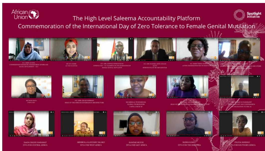
The high-level Saleema accountability platform, February 2021

FGM. This high-level virtual event convened 106 stakeholders including: the Ambassador of the European Union to the African Union; the Head of the African Governance Architecture; the Commissioner on Gender of the African Commission on Human and People's Rights; the elected member of the African Committee of Experts on the Rights and Welfare of the Child and the African Union Special Rapporteur on Child Marriage and other Harmful Practices; and civil society: the African Women Leaders Network.