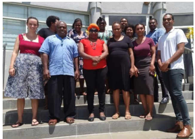
Vanuatu EVAWG Civil Society Reference Group Meeting, November 2021

Vanuatu Women's Centre (VWC) and Vanuatu Christian Council (VCC) were strategically included into the CSNRG to support, advocate, and strengthen the programme service provision to survivors of domestic violence and engagement with the Church and religious institutions. VWC is an established CSO with good capacity and substantial resources from the Australian Department of Foreign Affairs and New Zealand Ministry of Foreign Affairs dedicated to providing services to survivors of Domestic Violence. VWC has a vast network across all six provinces of Vanuatu and brings to the CSNRG membership ample experience of working with donors and development partners. VCC, on the other hand is very instrumental in social norm change with the Church and religious institutions. Though proactive engagement of the CSNRG in programme delivery was not undertaken in 2021 due to the COVID-19 Pandemic and delays in the recruitment at UN, a clear mechanism for it to support national and community CSOs and fast track delivery in the remaining two quarters of Phase 1 implementation is embedded in their current work plan and strong representation.