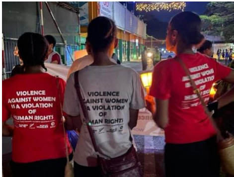
16 Days of activism vigil in Vanuatu