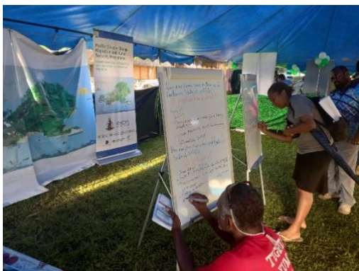
Consultations underway in Sanma province for the GBV in Evacuation Centre SOPs.