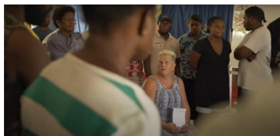
The Famili-I-Redi workshop underway in Vanuatu. The training was designed to address vulnerabilities that arise from labour migrations