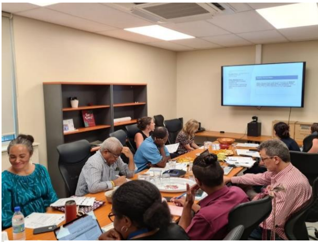
Vanuatu Steering Committee Meeting, November 2021

The Multi-Stakeholder Steering Committee is a governance arrangement for the Spotlight Initiative Country Programme in Vanuatu, providing overall strategic high-level management and coordination decisions related to the implementation of the programme. Although it is currently a programme focused committee, with significant other EU, DFAT and MFAT investments in EVAWG in the country, the Committee extended membership to other donors such as DFAT and MFAT as observers. This allowed for three large programmes on EVAWG implemented by the UN which are closely interlinked – the Spotlight Initiative, Pacific Partnerships and Transformative Agenda – to provide key updates on the elimination of VAWG in the country and created a platform for high level strategic decision making by all stakeholders as guided by the National policies and strategies.