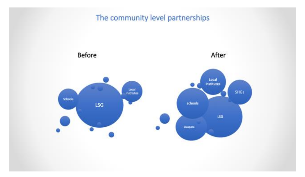
Figure 2. Community partnerships before and after the project delivery

9. At the community level, besides the productive partnership with the mentioned actors, the project contributed to enhancement of the partnership with the schools and diaspora organizations. Some teachers and diaspora representatives are either part of the SHG or benefitted of the thematic capacity development actions. The figure 2 illustrates the community level partnerships.