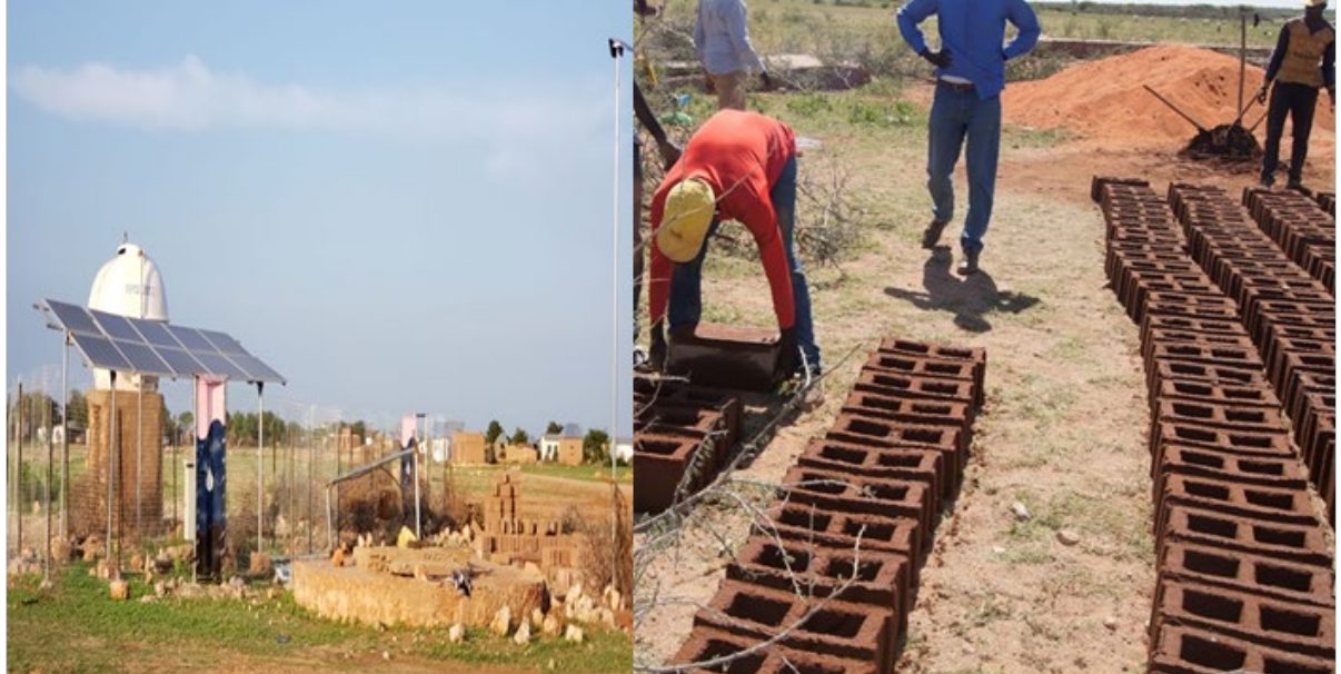
Photo: Left solar waterpump; right youth taking advantage of the solar pumped water to make bricks for income

Because community resilience building requires consultation and participation of local community beneficiaries, the project continued to support community dialogues and participatory planning to ensure their priority needs are taken into account and build on their traditional management systems rooted in their indigenous knowledge of how natural ecosystems function and provide services for their livelihood and survival. To this end, the project supported community indigenous knowledge and traditional management systems as part of the implementation of the Woreda Disaster Management plans implementation to increase community awareness, preparedness and response capacity in case of a disaster.