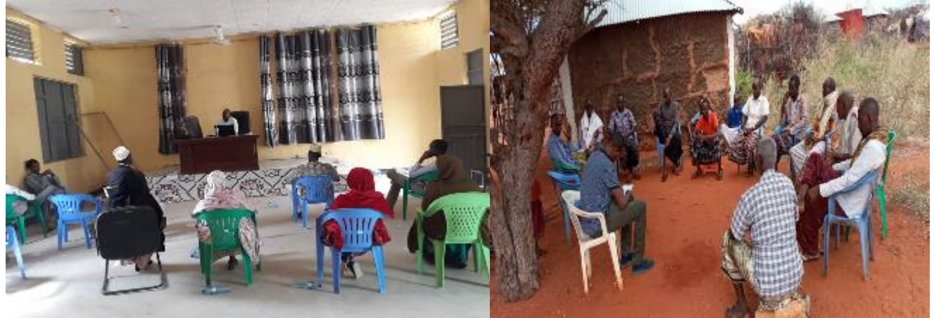
Training of Extension worker in Kabridahar Woreda