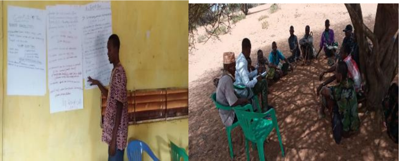
Training of Extension worker