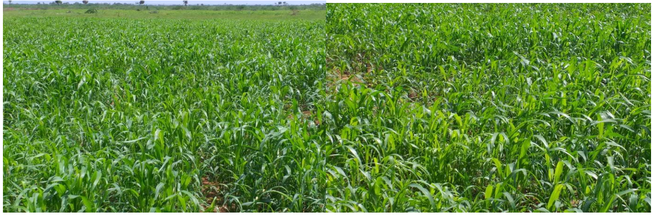
Improved forage grasses introduced in the project area