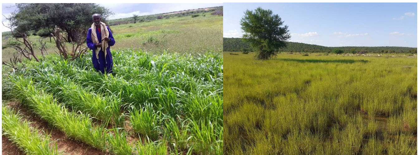
Forage production on reclaimed land