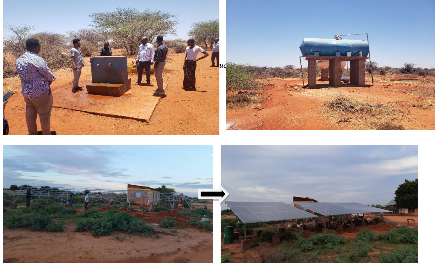
Baliwanaag Borehole rehabilitation through installing solar grids.