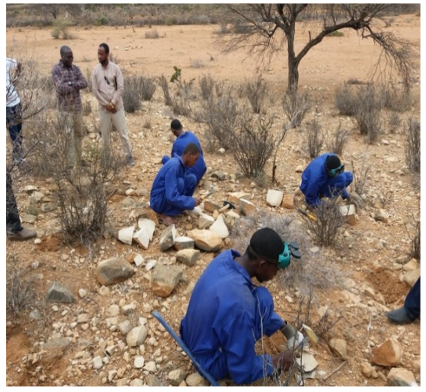
Photo 6: Youth engaged in cobblestones chiselling (left) and the cobble stones ready for sale (rights) as an alternative income anerration

As part of the livelihood diversification and resilience building efforts the project provided a various business skill development and capacity building training to 2404 individuals including 714 beekeeping members (286M, 428F with 23PWD (13M, 10F) in Kebridehar and 917 (412M and 505F; with 8PWD (4M and 4F) in warder woreda and 773 youth and women members to strength their business skill; cost benefit calculations, risk taking, market considerations and community purchasing power.