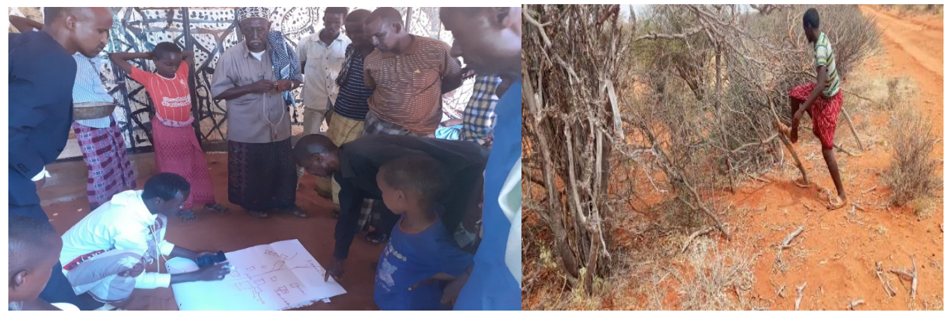
Resource mapping by the community

In addition, 500 meters of canal were constructed using stone and soil bund to divert flood into the farmlands that have orchards and grasses. This is undertaken as part of rangelands restoration to complement the work of the partner. A total 40 households benefited from cash for work, and grass production on the area.