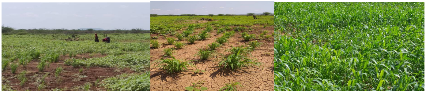
Forage on reclaimed land (weeding) Forage crop at early stage Forage crop on reclaimed land