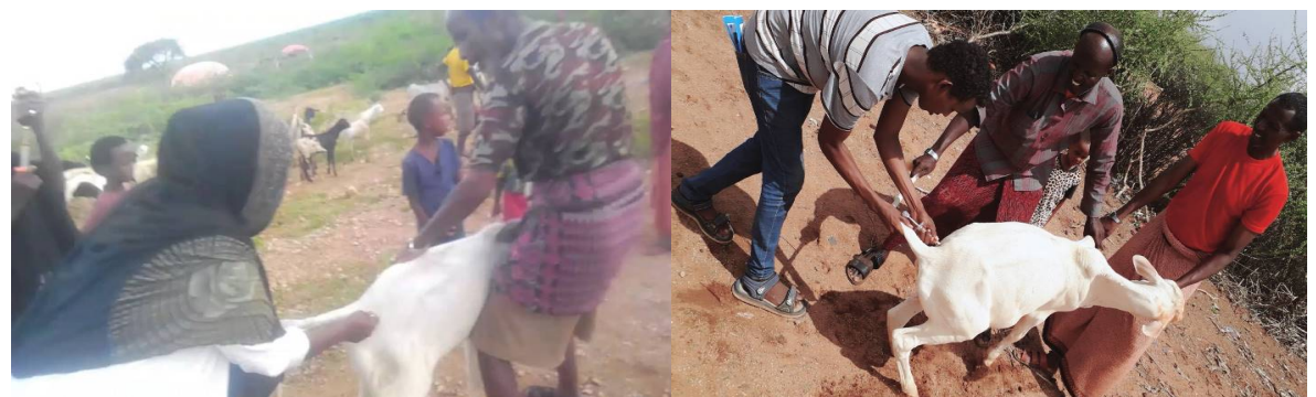
Treatment campaign in Kabridahar Woreda

*number of beneficiary HHs avoiding double counting