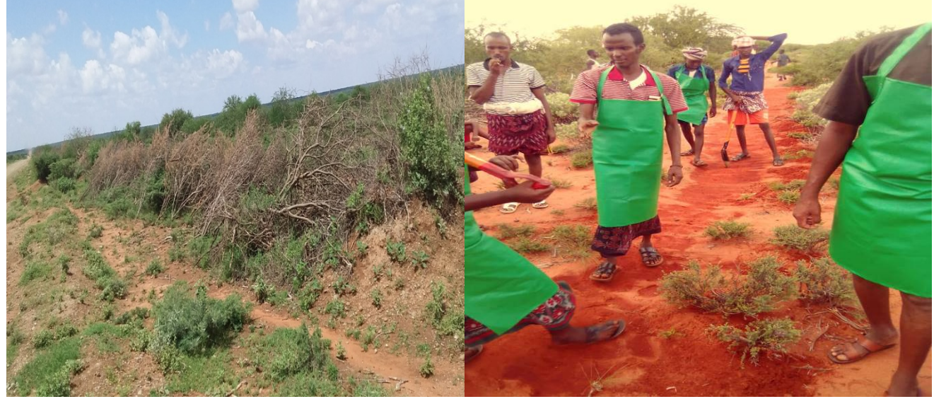
Range Land enclosure