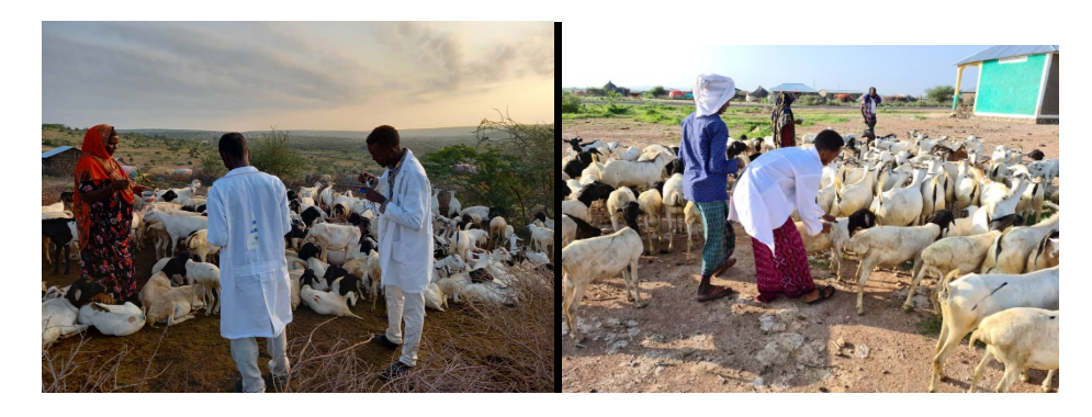
Indicator 1.2.2 No. HHs receiving improved young stock management package

The project commissioned Jigjiga University to undertake a research project entitled investigation on young stock mortality and diseases, review of animal health delivery system and development of public private veterinary linkages in somali region: the case of Kebridahar Warder Woredas