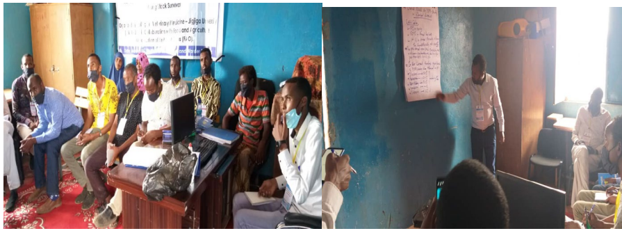
ToT for extension workers on young stock management and PPP