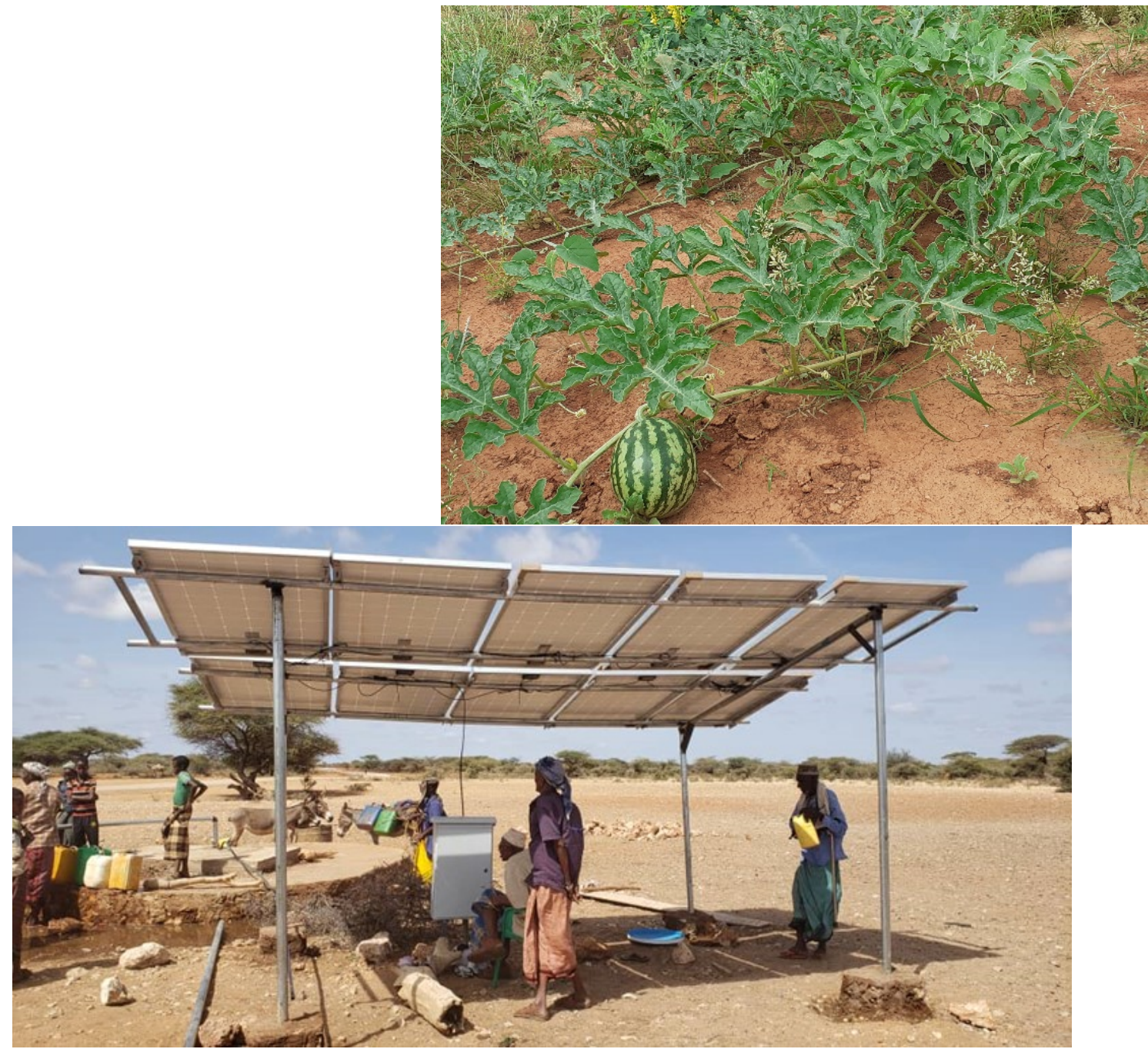
Photo 3: Left is solar water pump and Right is watermelon garden irrigated by water from the solar water pump