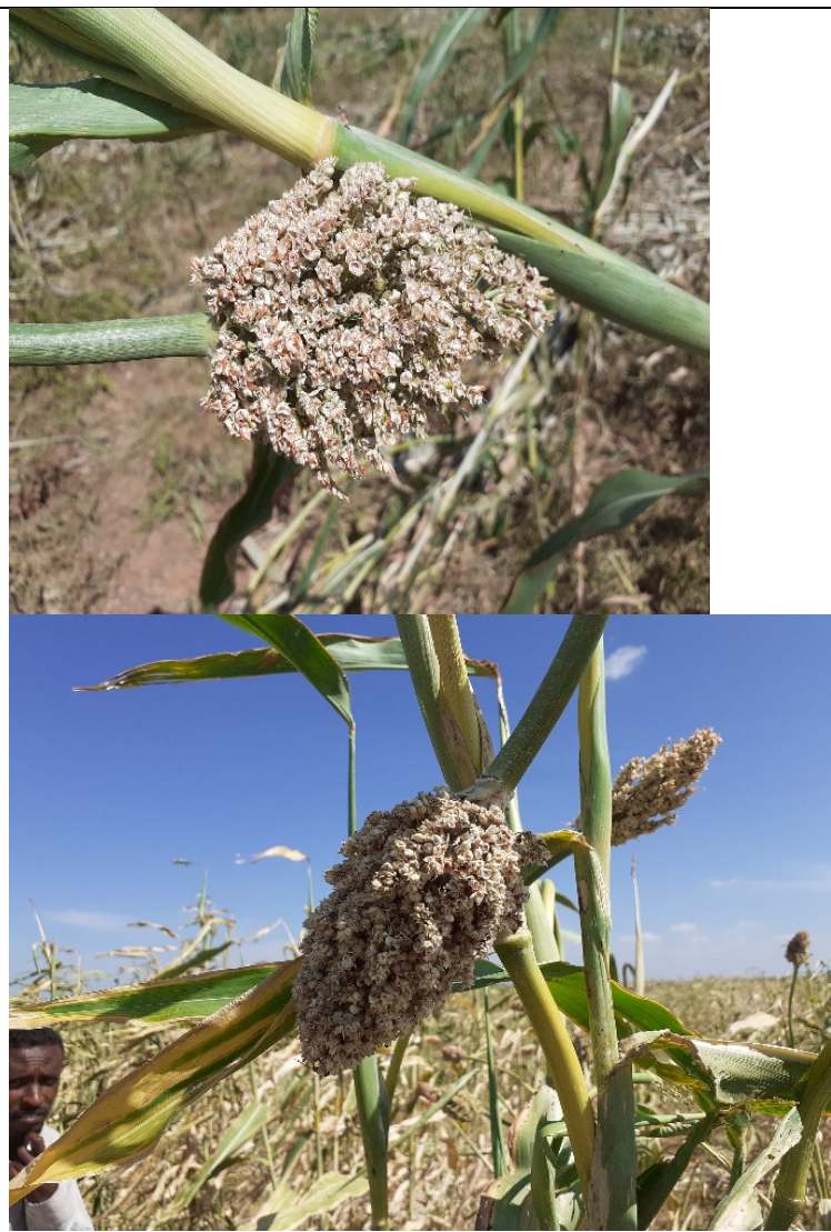
Photo 8: Sorghum Crops damaged by locusts in Bundada kebele, Kebredahar Warder, Somali region