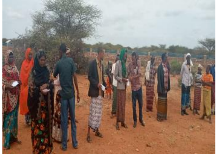
Feed voucher distribution and awareness creation on utilization and management of feed distributed

beneficiaries because of this intervention. The indirect beneficiaries included transporters, feed producers and suppliers. Other indirect beneficiaries included Government partners such as the Somali Region Livestock Resources and Pastoral Development Bureau, the Regional Disaster Prevention and Preparedness Bureau, target woredas administration and relevant line offices who were directly involved in the implementation and monitoring and coordination of the project. The achievement on the indicator is more than targeted.