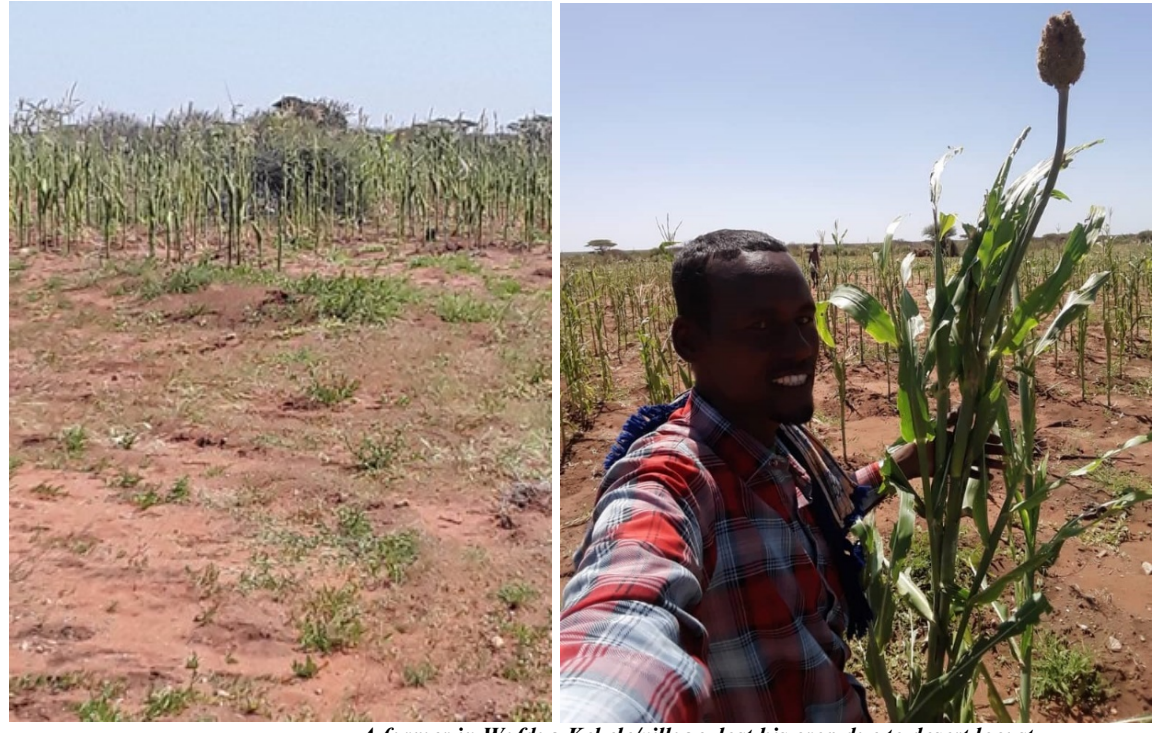
A farmer in Wafdug Kebele/village lost his crop due to desert locust