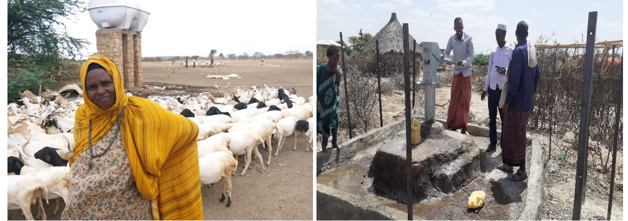
Kerinbile kebele constructed elevated roto tank with10m3tank

Table 6: Details of rehabilitated water sources in warder and Kebridehar districts