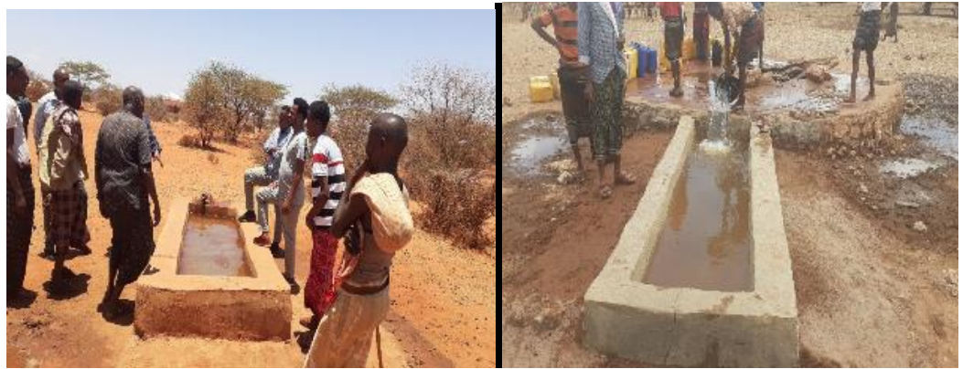
Cattle troughs constructed in Warder Woreda