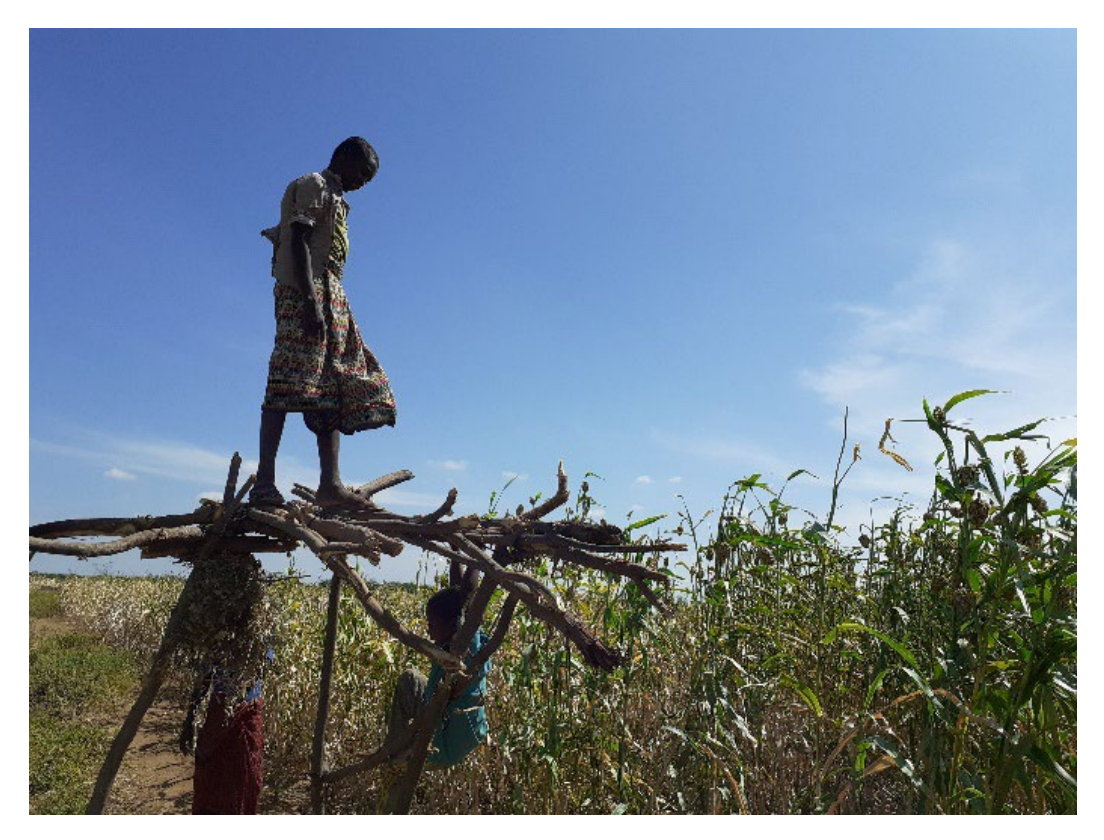
Photo 9: Children guarding crop farms against locusts and other bird pests