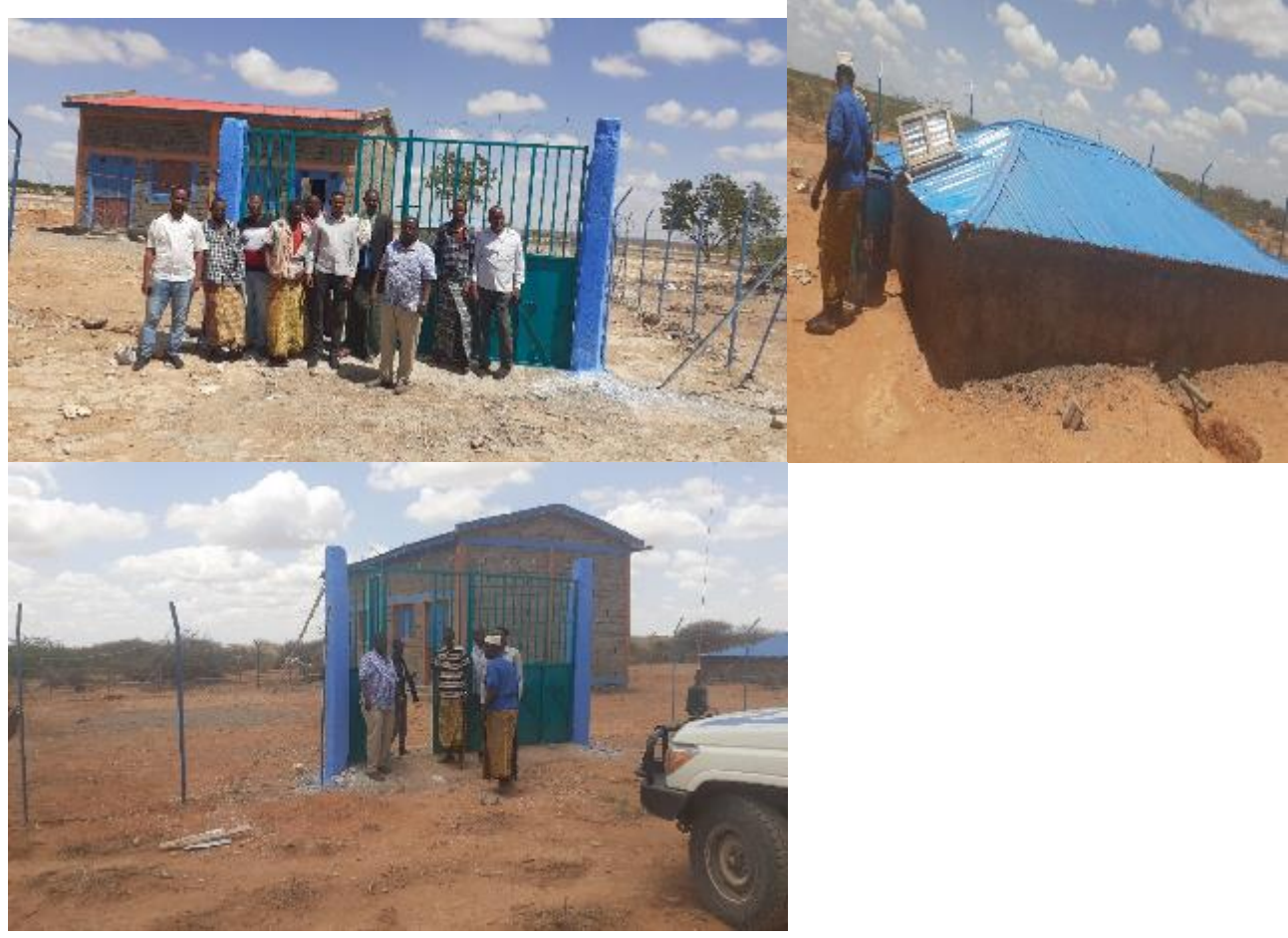
Feed storage/shade and Molasses Tanker

The completed hay storage and molasses tanker were handed over to the government and the community of the target kebeles. Moreover, users were especially satisfied on the support provided and indicated that they will use it for intended purpose.