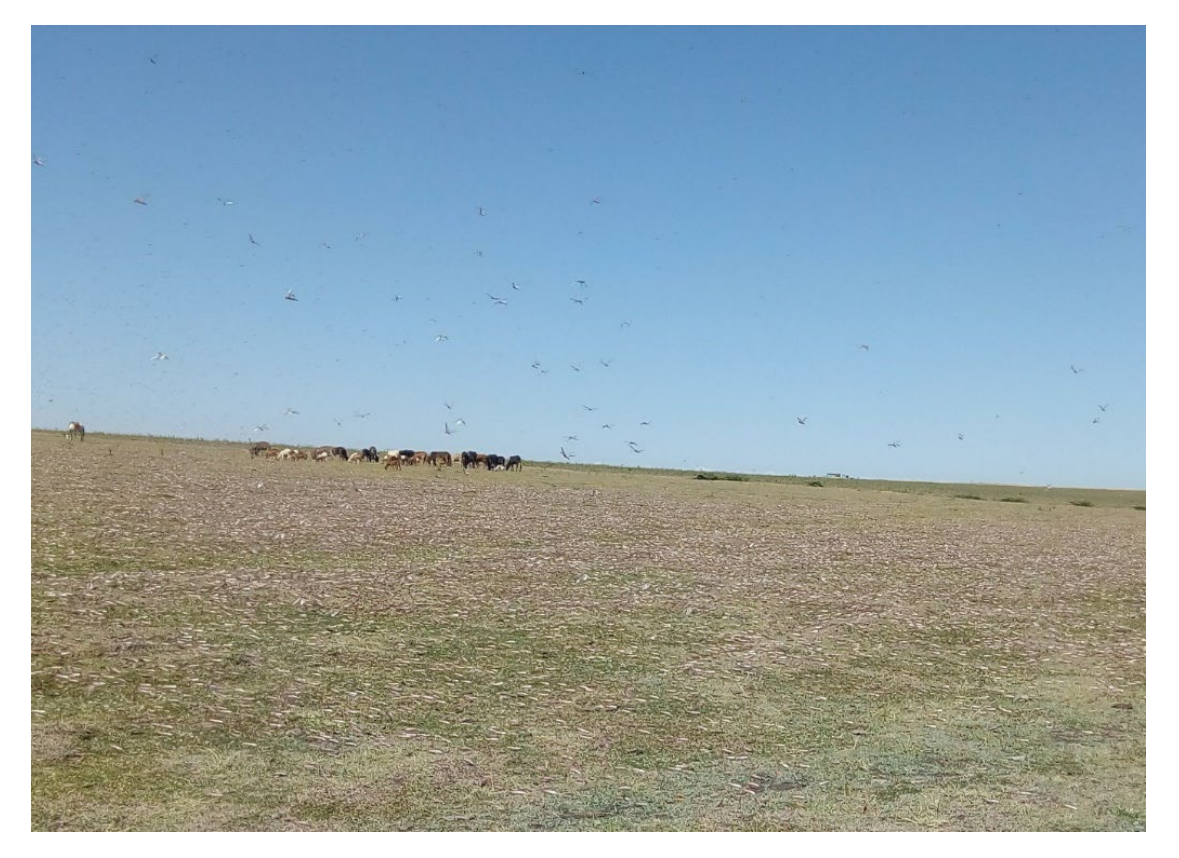
Photo 10: Locust swarms affecting rangelands; competing with livestock for pasture