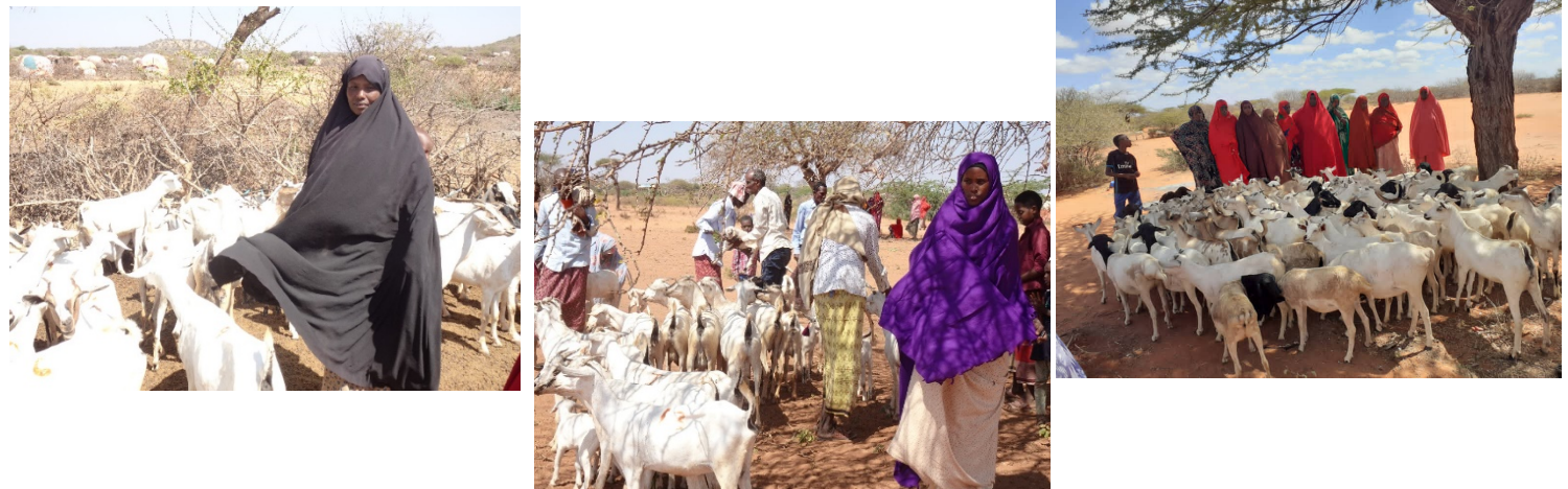
female headed households provided breeding goats at Warder and Kebridehar districts

The project could not reach the target because fewer number of females Headed households in project area, high market prices of goats due to inflation resulting from low availability of goats in local markets and high demand of breeding goats in the project area.