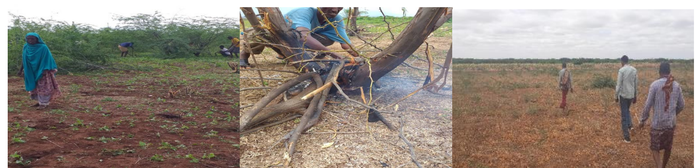
Beneficiaries on prosopis clearing Burning the root of Prosopis

The performance of the pasture and improved forage crop was good in the first year while the second-year planting faced shortage due to moisture at early stage and later desert locust damage the forage crop. In the first season, the beneficiaries harvested a total production of 600 tons dry matter, which was sufficient to feed 3200 TLU for 30 days. In addition, they harvested 4 tons of seed. In general, this activity helped beneficiaries to generate income from the sale of hay as well as provide supplementary feed to their animals. While in the second season (2020), forge crop performance was poor and near zero harvest was recorded due to desert locust infestation. The project achieved its objective of introducing improved forage seed sowing on land cleared from Prosopis and increased the Availability of feed that will be used during dry period or shortage of feed. The overall achievement on this indicator was 100%. The base line is 40 Ha.