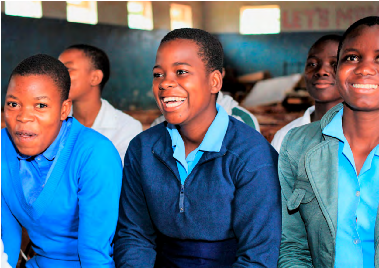
Spotlight Initiative Scholarship beneficiaries at Mvera Community Day Secondary School.

SI improved the sustainable integration of SRHR into local development plans by enhancing the capacities of decision-making structures at district and village level on this area. Traditional authorities were also trained on SRHR, allowing them to better support women and girls' rights to access services.