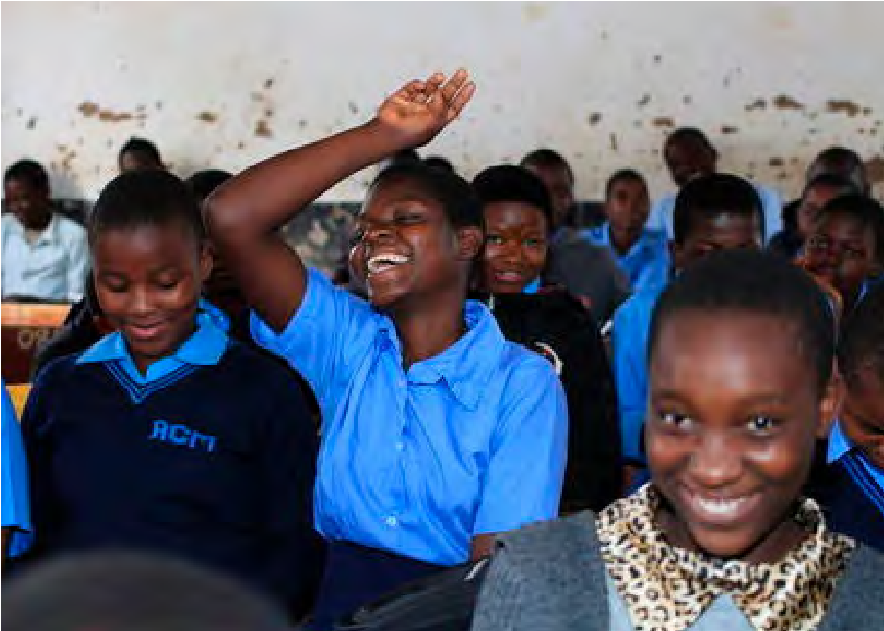
SI Scholarship beneficiaries interact during a class session.