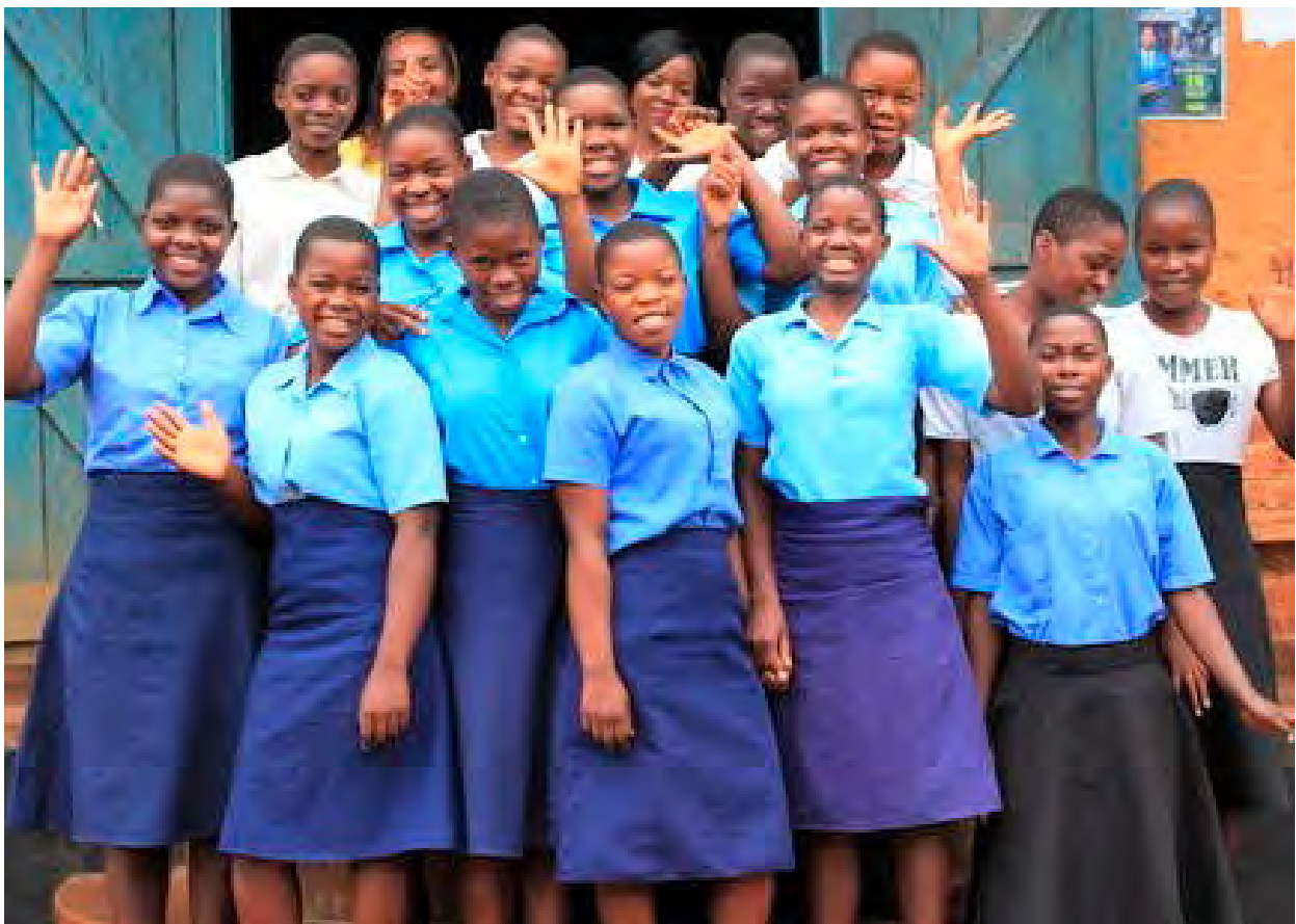
Scholarship beneficiaries at Mvera CDSDS.

COVID-19 became an opportunity to strengthen survivor support services in hard to reach communities. For instance, the Malawi Police Service established a hotline 932 dubbed “Mthetsa Nkhanza”, which enabled police to rapidly respond to issues of SGBV. Grassroots IPs and Government service providers were equipped with bicycles, motorbikes and mobile devices to