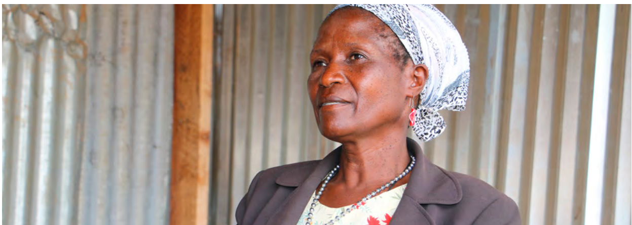
A community leader explains how SI has empowered them as agents of change in Ntchisi district.

During the 16 days of Activism to EVAWG, the SI initiated a high-level panel discussion aligned to the global theme “orange the world; fund; respond; collect” 25 , and involving the RC, EU Chargé d’Affaires, a High Court Judge, and member of the CS-NRG. The discussion aired on TV reaching 10,566,000 people, a further 10,206,000 by radio reaching, and 592,565 people via Facebook live streaming.