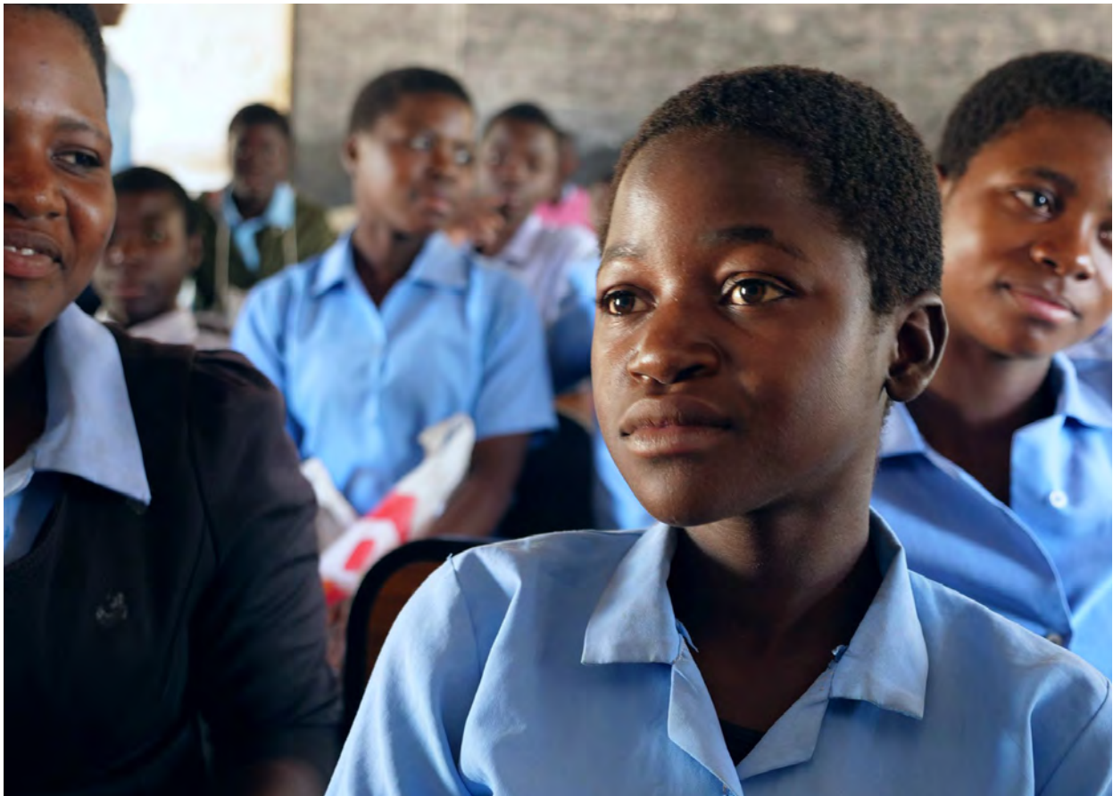
A class session with some of SI scholarship beneficiaries at Mvera Community Day Secondary School.

The roles of Chiefs, community leaders, and CBOs were also unexpectedly reinforced when travel restrictions required the UN team to rely on these actors for continued reporting and referrals of SGBV/HP cases.