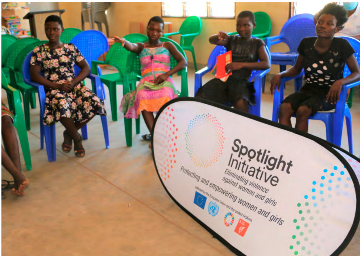
Beneficiaries interact during a mentorship session in NkhataBay District.

At both national and district levels, the SI is strategically positioned under the Gender Technical Working Groups (GTWGs). At national level, the Gender and Human Rights Working Group (GHRWG) has a standing agenda item for the SI, during which key updates are shared with the group. This arrangement reflects the spirit of UN Reform by allowing the SI to be part of broader gender and human rights discussions, which in turn ensures greater complementarity at the inter-agency level, and facilitates holistic and multi-lateral decision making for the SI. At district level, the COPs jointly report to the GTWGs which are also being strengthened through Pillar 2.