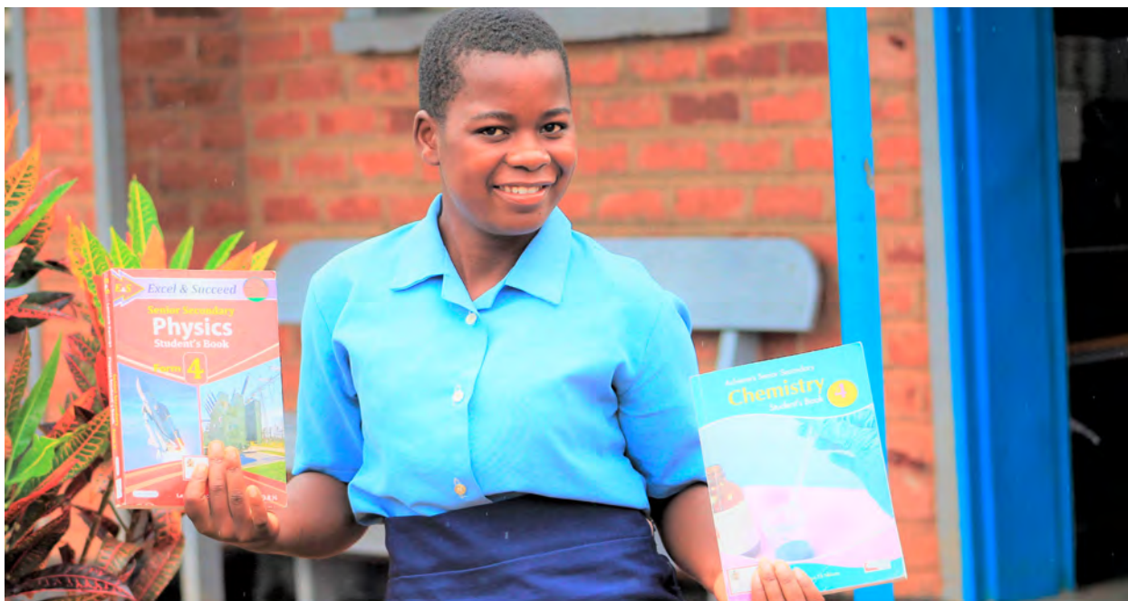
Girls belong in class, a scholarship beneficiary in Dowa district.

In response to the restrictions during the peak of the COVID-19 pandemic, the SI brought onboard the mobile-based organization VIAMO, tasked with supporting training and awareness interventions through mobile platforms.