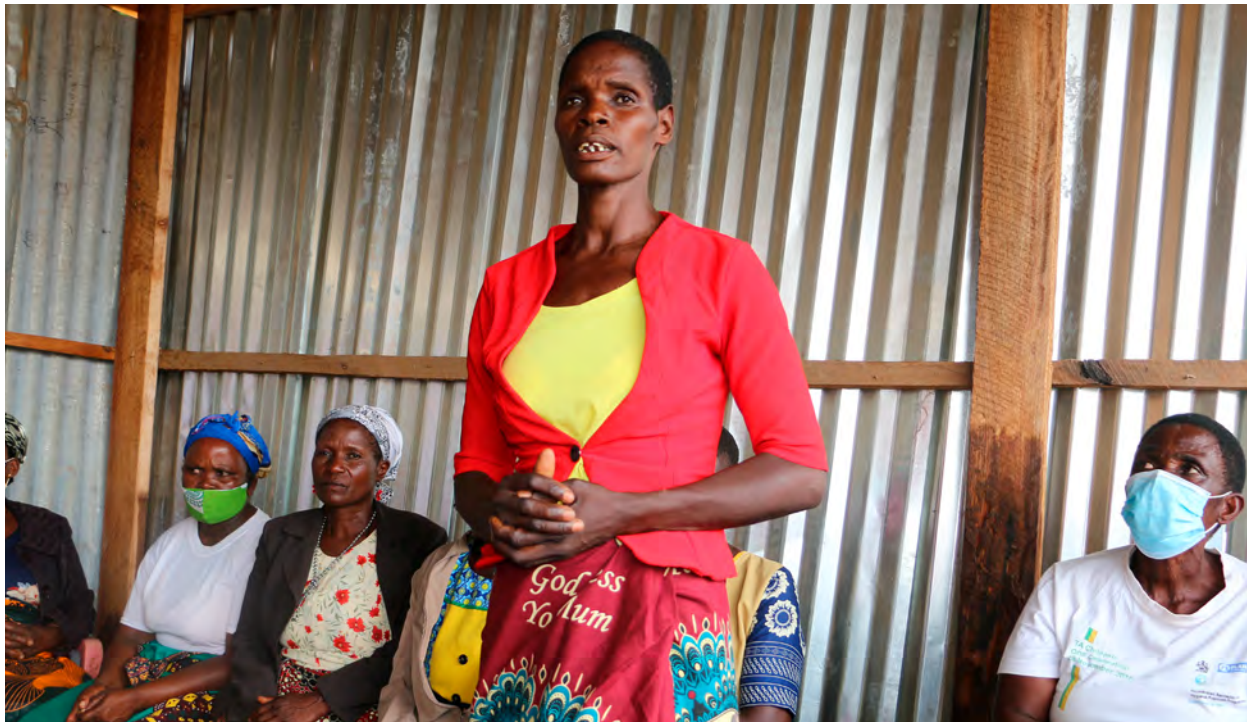
Traditional leaders interact during a chiefs forum in Ntchisi.

Women's grassroots organisations are more knowledgeable on SRHR and are better able to advocate for their rights and develop/ implement plans to enhance their SRHR. In keeping with the LNOB principle the SI created and strengthened networks of female sex workers (FSWs), and Women Living with HIV and AIDS, and trained them on their SRHR, prompting them to raise awareness and improve uptake of SRH services among members of this especially vulnerable group.