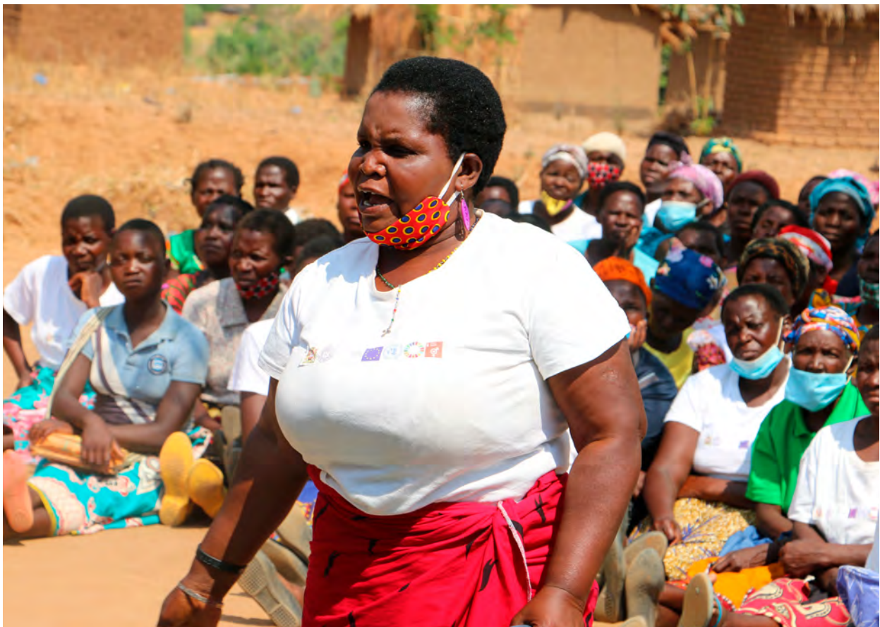
A beneficiary explains how SI has benefited her during a mission in Ntchisi District.

The events of 2020 including significant political shifts and the response to COVID-19 magnified these challenges. In February, the Malawi Constitutional Court nullified the results of the presidential elections held in May 2019, which it said were characterised by “widespread, systematic and grave irregularities”. The Court proceeded to order new elections within 150 days and presidential elections were held once again in late June. The opposition party won, and by July a new Government was installed. The pre and post-electoral periods were further complicated by the ongoing COVID-19 Pandemic, with the electoral activities triggering an increase in the number of COVID-19 cases. These periods also saw a deceleration in the pace of SI implementation due to difficulties in accessing communities, the preoccupation of government counterparts, and concerns that SI events could be politicised. Nonetheless, implementation continued, with greater care taken by the RC and UN Senior Management to ensure that the SI was not politicised during the pre-electoral period.