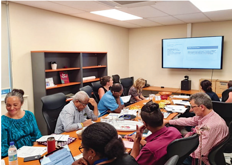
Vanuatu Steering Committee Meeting, November 2021

The Multi-Stakeholder Steering Committee is a governance arrangement for the Spotlight Initiative Country Programme in Vanuatu, providing overall strategic high-level management and coordination decisions related to the implementation of the programme. Although it is currently a programme focused committee, with significant other EU, DFAT and MFAT investments in EVAWG in the country, the Committee extended membership to other donors such as DFAT and