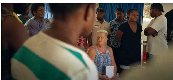
The Famili-I-Redi workshop underway in Vanuatu. The training was designed to address vulnerabilities that arise from labour migrations