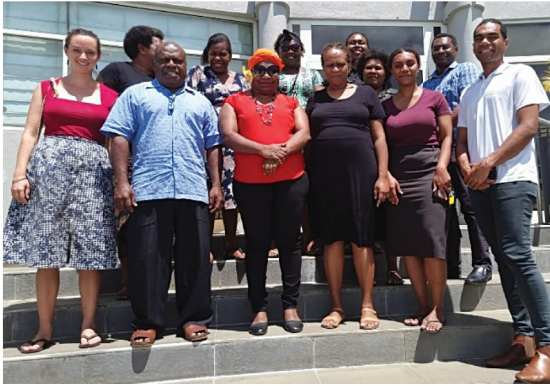
Vanuatu EAWG Civil Society Reference Group Meeting, November 2021

small businesses, women in the humanitarian sector, people with disabilities, LGBTQI community, faith-based organizations and organisations who work with men and boys.