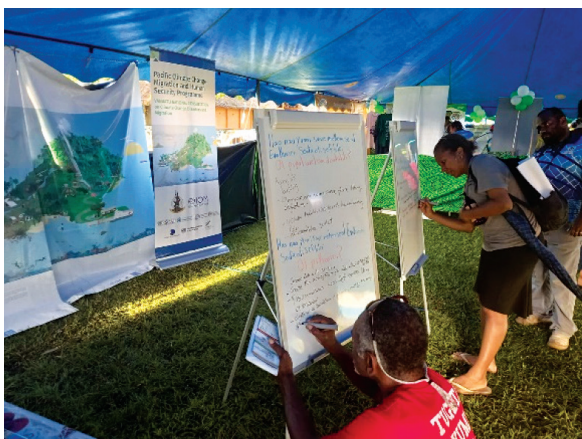
Consultations underway in Sanma province for the GBV in Evacuation Centre SOPs.