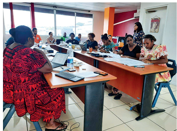
Capacity-building workshop on collecting, analysing and understanding Gender-based Violence data.